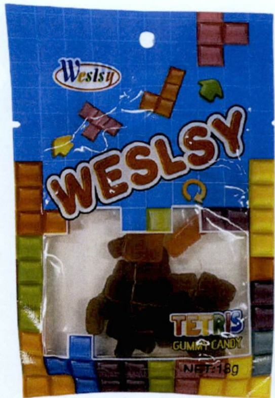
Figure 3. Unregistered WESLSY Tetris Gummy Candy