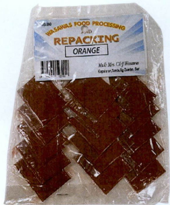
Figure 5. Unregistered WASAWAS FOOD PROCESSING AND REPACKING Orange