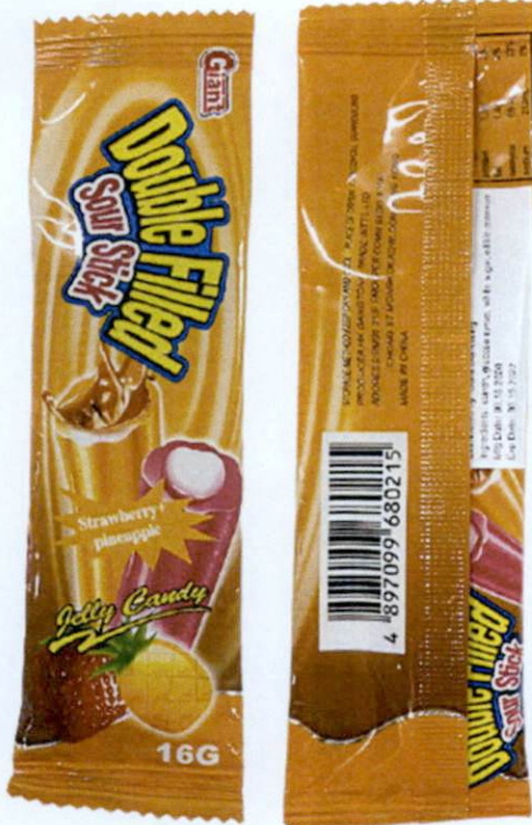
Figure 2. Unregistered GIANT Double Filled Sour Stick Strawberry+Pineapple Jelly Candy