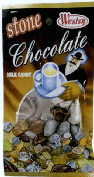
Figure 1. Unregistered WESLSY Stone Chocolate Milk Candy, 10 g

The Food and Drug Administration (FDA) warns all healthcare professionals and the general public NOT TO PURCHASE AND CONSUME the following unregistered food products: