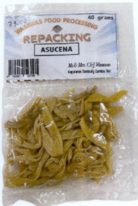
Figure 4. Unregistered WASAWAS FOOD PROCESSING AND REPACKING Asucena, 40 g