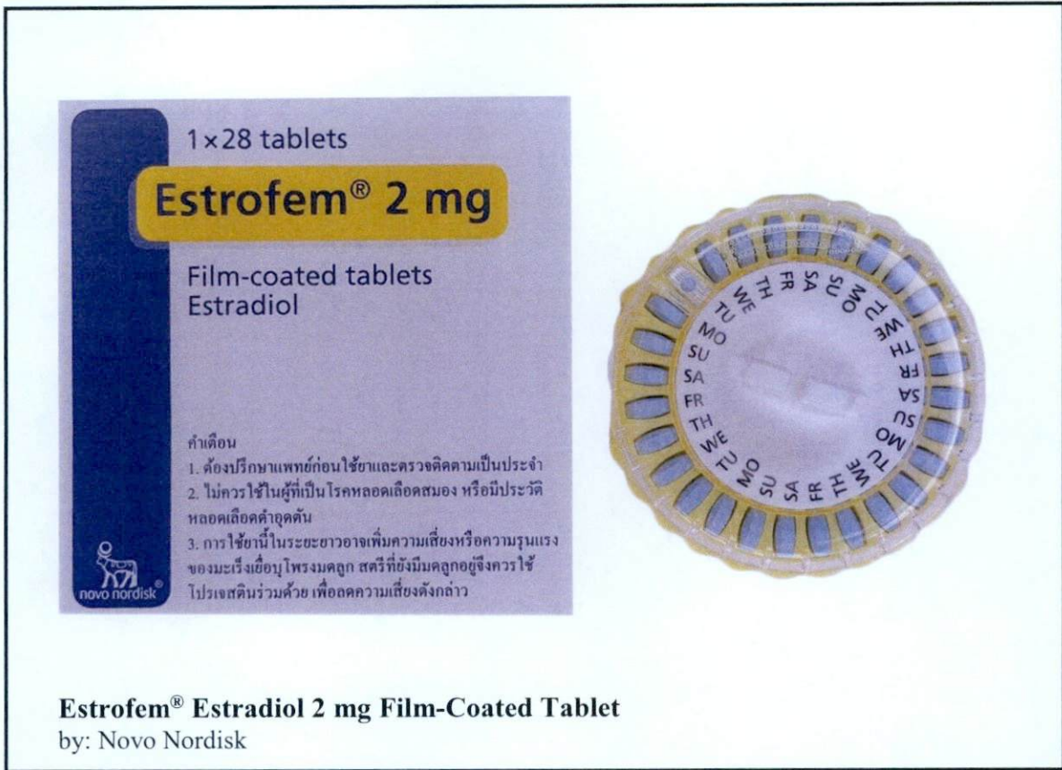
Estrofem® Estradiol 2 mg Film-Coated Tablet by: Novo Nordisk