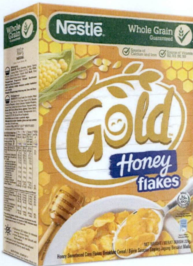
Figure 1. Nestle Gold Honey Flakes Breakfast Cereal