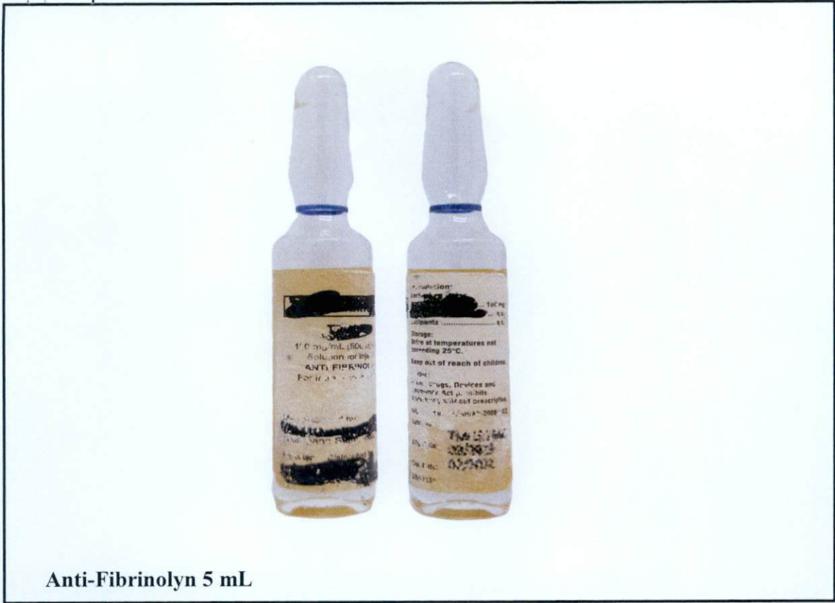
Anti-Fibrinolyn 5 mL