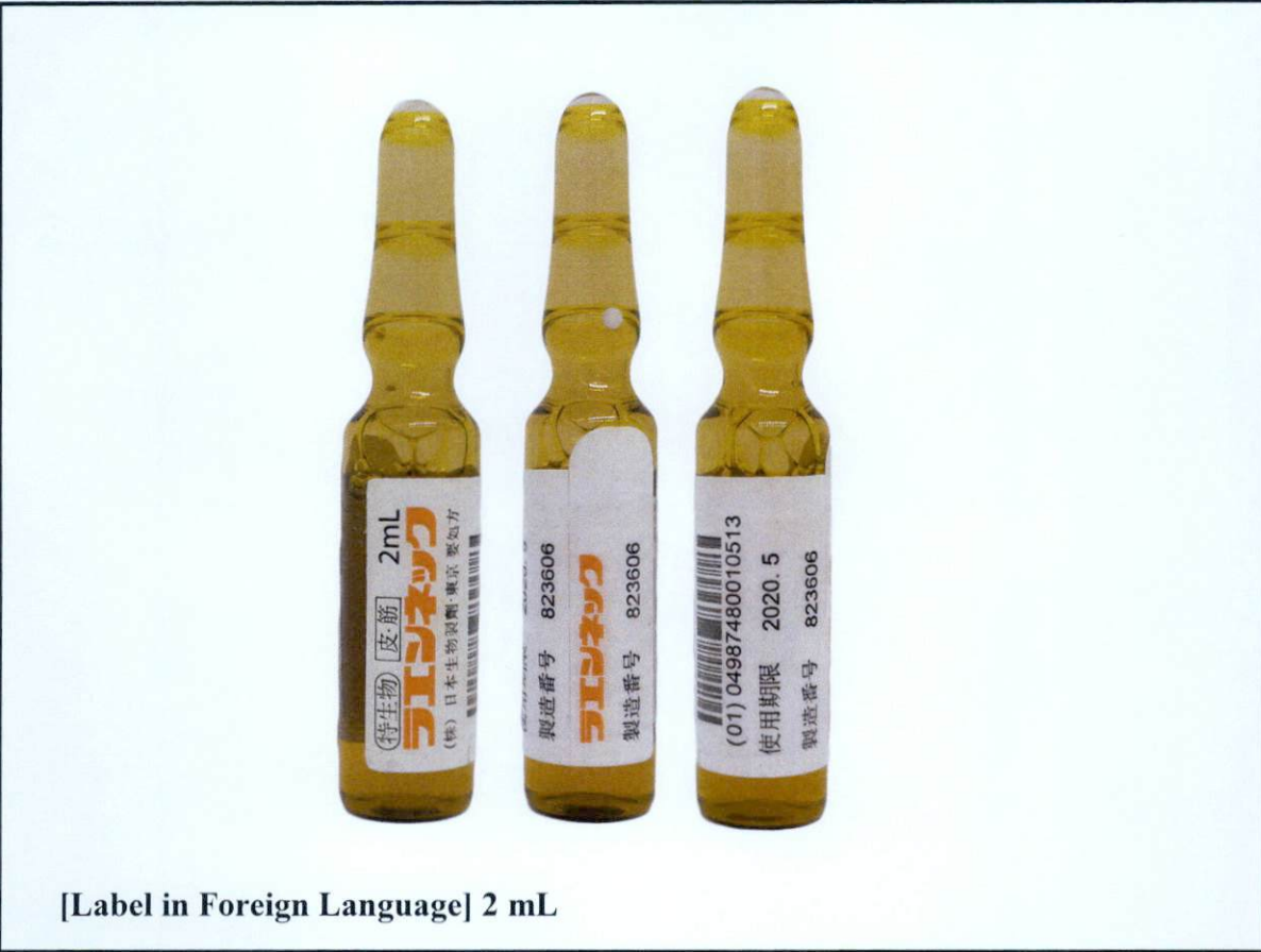
[Label in Foreign Language] 2 mL