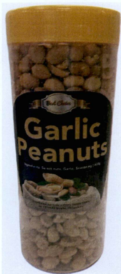
Figure 1. The Approved label of BEST CHOICE Garlic Peanuts with registration number FR- 4000008551962 valid until 11 November 2026 .

The Food and Drug Administration (FDA) informs the public that the following food products are now registered by the Market Authorization Holder (MAH) COLE'S PINOY SWEET TREATS in accordance to existing FDA rules and regulations.