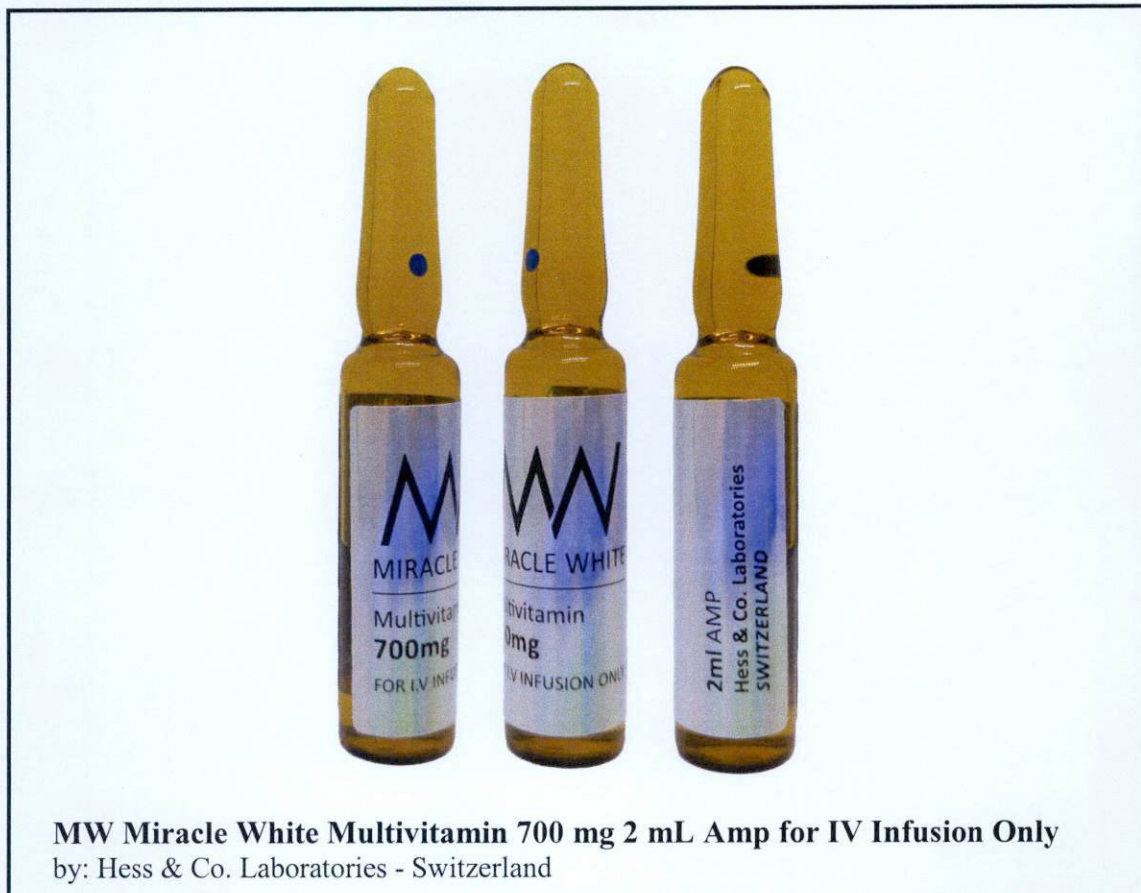
Figure 1. Unregistered drug product

The Food and Drug Administration (FDA) advises the public against the purchase and use of the following unregistered drug products: