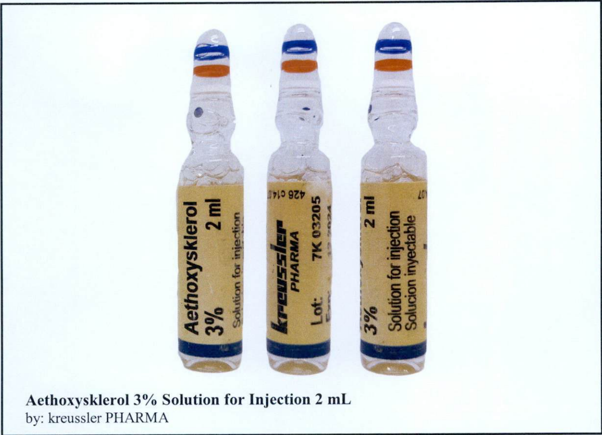
Aethoxysklerol 3% Solution for Injection 2 mL by: kreussler PHARMA