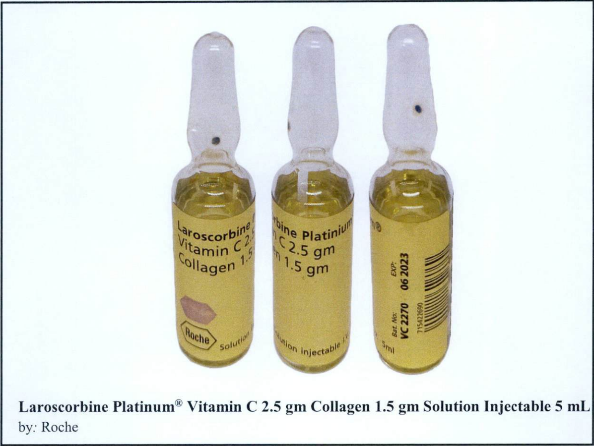
Laroscorbine Platinum® Vitamin C 2.5 gm Collagen 1.5 gm Solution Injectable 5 mL by: Roche