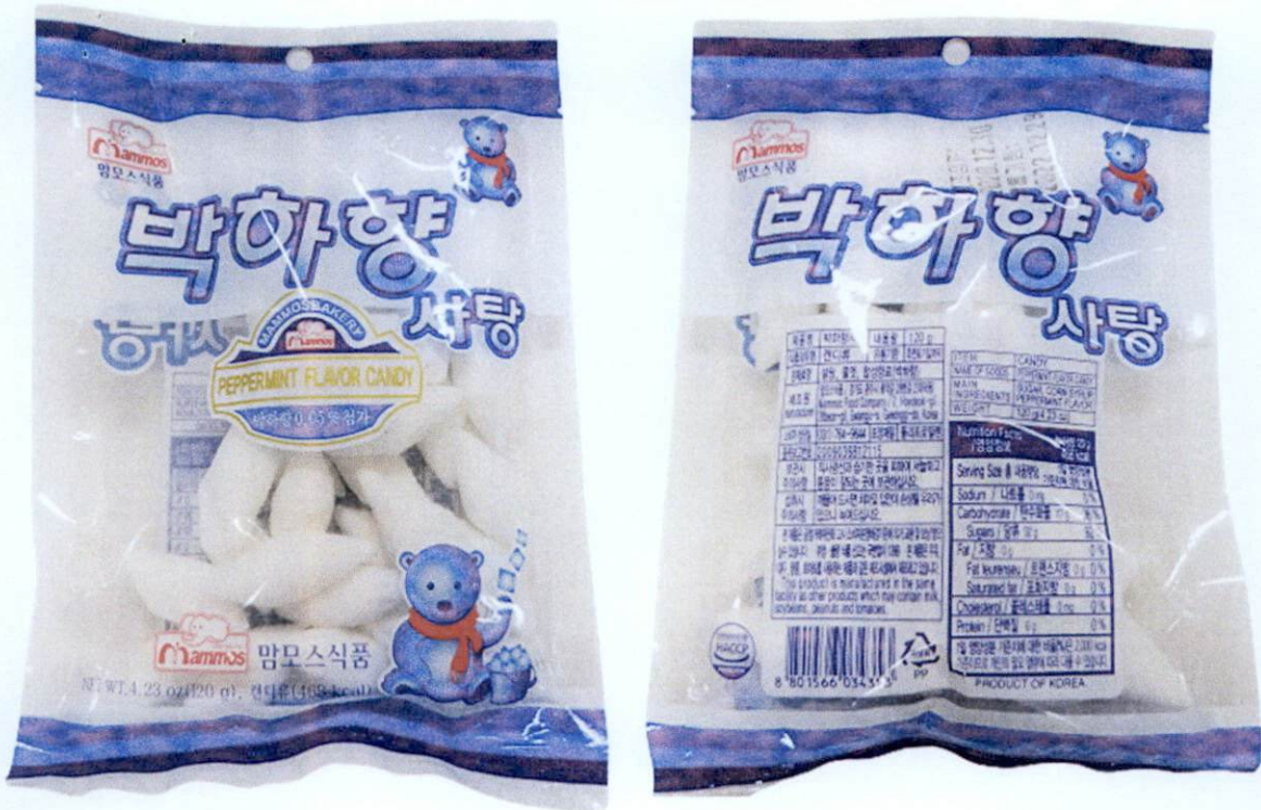
Figure 2. Unregistered MAMMOS Peppermint Flavor Candy (In Foreign Language)