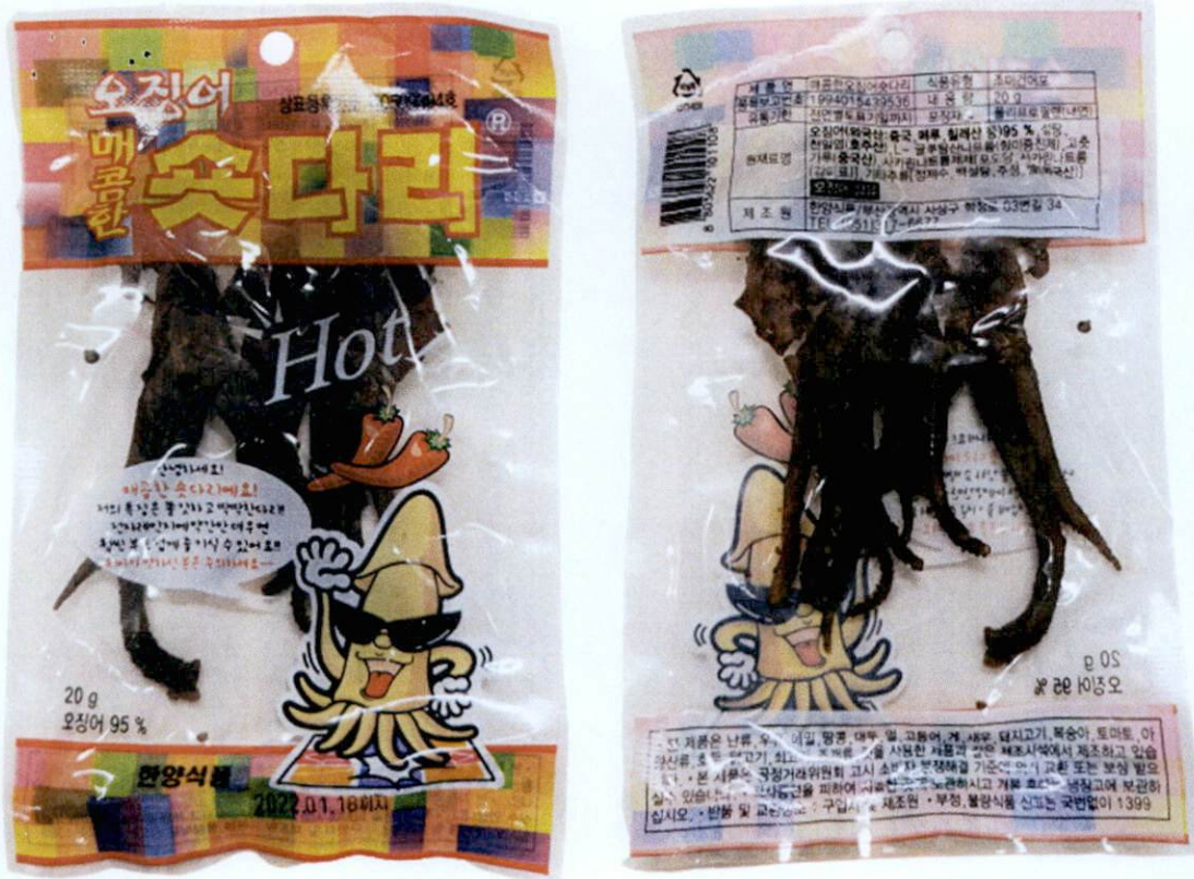
Figure 4. Unregistered HOT Dried Squid in Transparent and Rainbow Packaging (In Foreign Language)