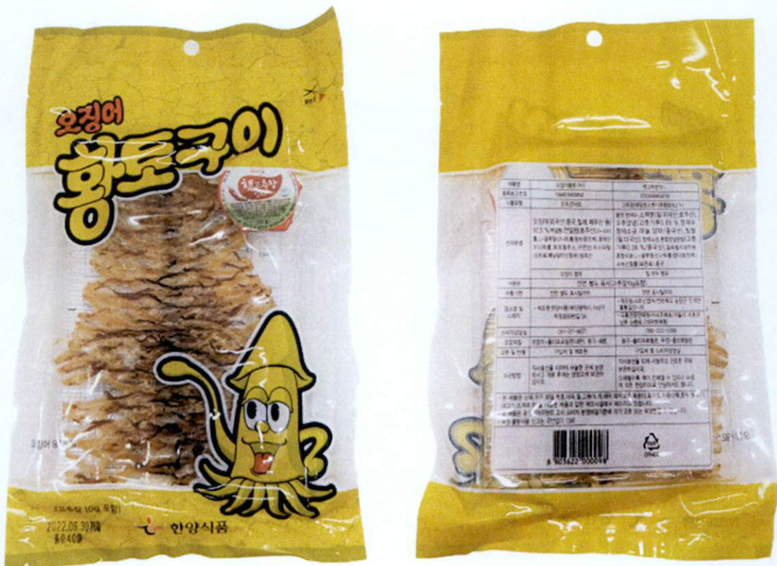
Figure 3. Unregistered Dried Squid in Transparent and Yellow Packaging (In Foreign Language)