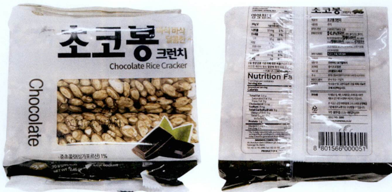
Figure 5. Unregistered MAMMOS Chocolate Rice Cracker