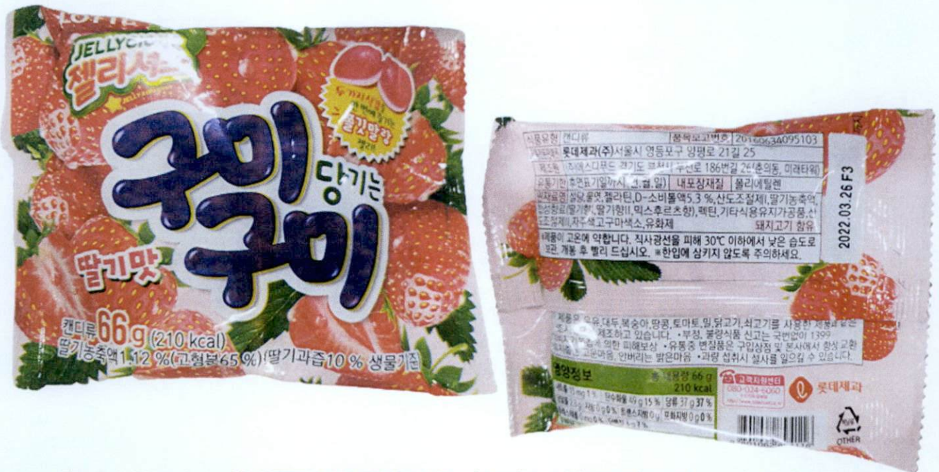
Figure 1. Unregistered LOTTE JELLYCIOUS Food Product with Strawberry Image in Pink Packaging (In Foreign Language)

The Food and Drug Administration (FDA) warns all healthcare professionals and the general public NOT TO PURCHASE AND CONSUME the following unregistered food products: