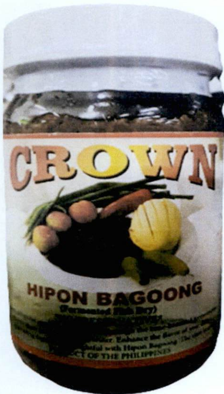
Figure 3. Unregistered CROWN Hipon Bagoong (Fermented Fish Dry), Approx. 250g