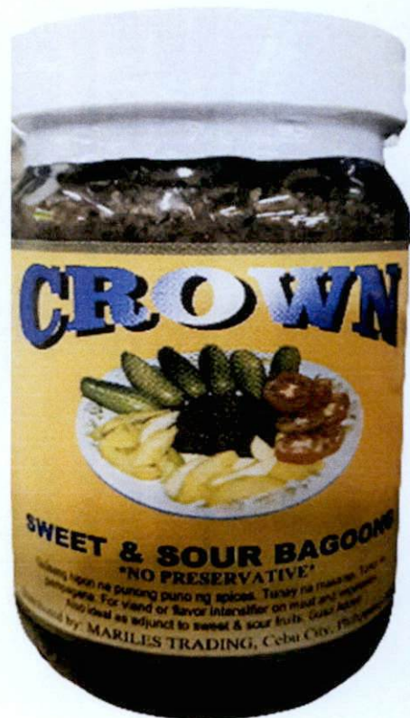
Figure 4. Unregistered CROWN Sweet & Sour Bagoong, Approx. 250g