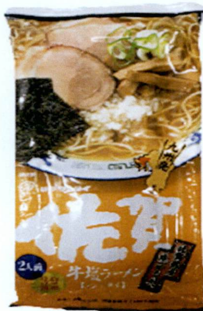
Figure 1. Unregistered MARUTAI-SAGA Ramen Non-Fry Type w/ Roasted Seaweed, 185 (Labels are in foreign language)

The Food and Drug Administration (FDA) warns all healthcare professionals and the general public NOT TO PURCHASE AND CONSUME the following unregistered food products: