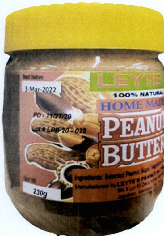
Figure 3. Unregistered LEYTE'S 100% NATURAL HOME MADE Peanut Butter, Net Wt. 230g