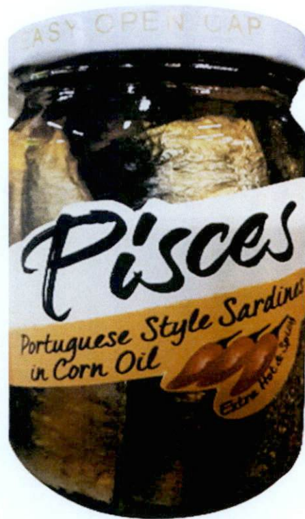
Figure 2. Unregistered PISCES Portuguese Style Sardines in Corn Oil – Extra Hot & Spicy, Net Wt. 225g (7.937oz)