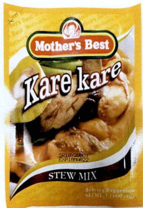
Figure 4. Unregistered MOTHER'S BEST Kare Kare Stew Mix, Net Wt. 35g (1.23)