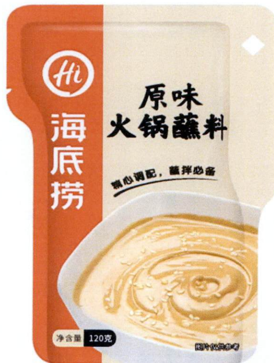
Figure 1. Unregistered HI (Sauce like product in red-cream colored packaging (Labels are in foreign language))

The Food and Drug Administration (FDA) warns all healthcare professionals and the general public NOT TO PURCHASE AND CONSUME the following unregistered food products: