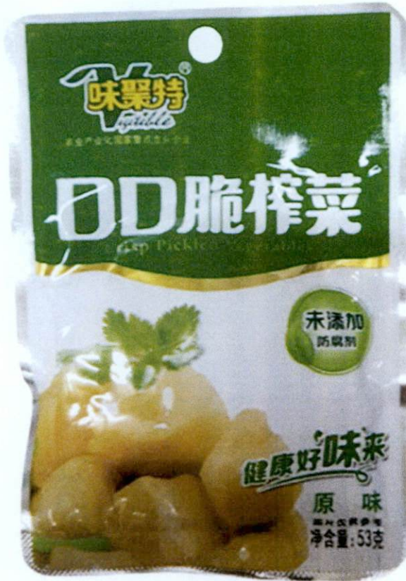
Figure 2. Unregistered VEGETABLE Crisp Pickled Vegetable in white plastic (Labels are in foreign language)