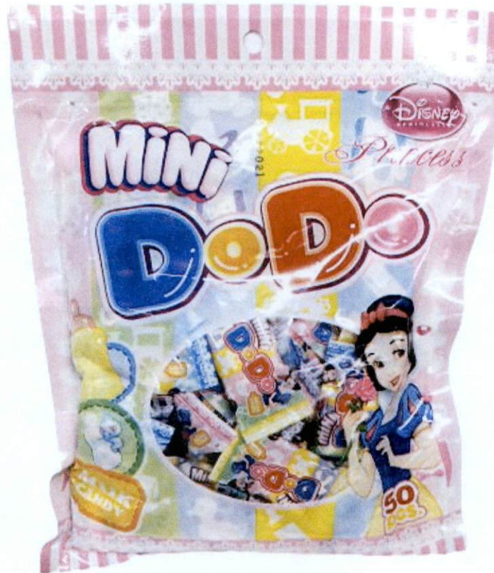
Figure 2. Unregistered DISNEY PRINCESS Mini Dodo Milk Candy