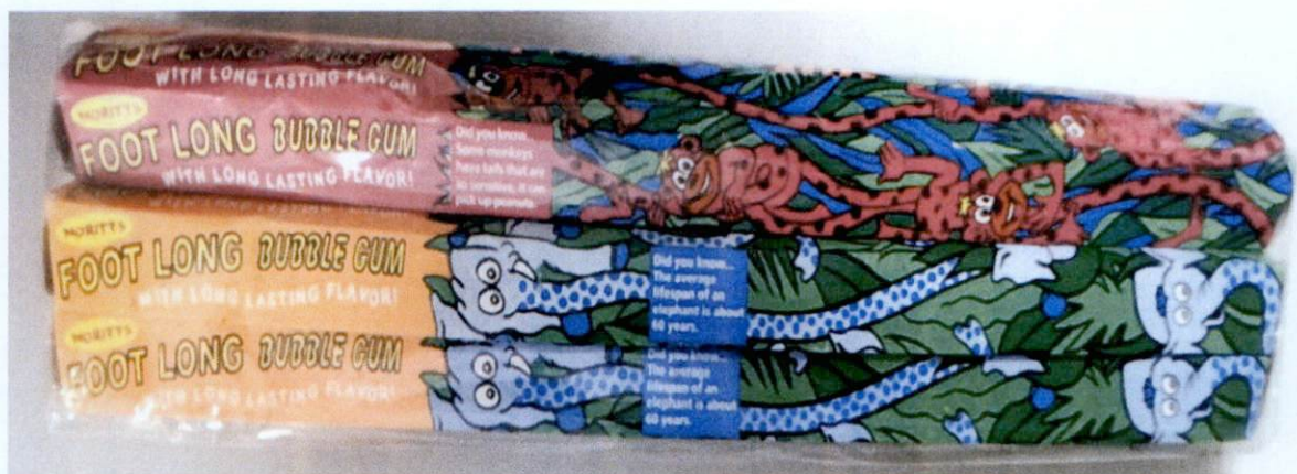
Figure 3. Unregistered NORITTS Foot Long Bubblegum