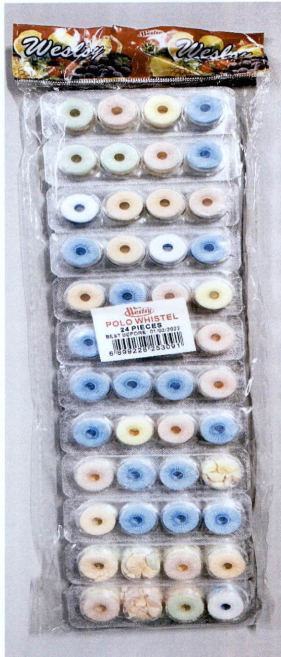
Figure 4. Unregistered WESLSY Polo Whistel

The FDA verified through online monitoring or post-marketing surveillance that the abovementioned food products are not registered and no corresponding Certificates of Product Registration (CPR) have been issued. Pursuant to the Republic Act No. 9711, otherwise known as the “Food and Drug Administration Act of 2009”, the manufacture, importation, exportation, sale, offering for sale, distribution, transfer, non-consumer use, promotion, advertising or sponsorship of health products without the proper authorization is prohibited.