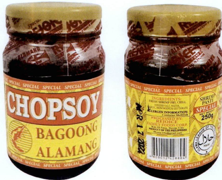
Figure 1. Unregistered CHOPSOY Special Bagoong Alamang

The Food and Drug Administration (FDA) warns all healthcare professionals and the general public NOT TO PURCHASE AND CONSUME the following unregistered food products: