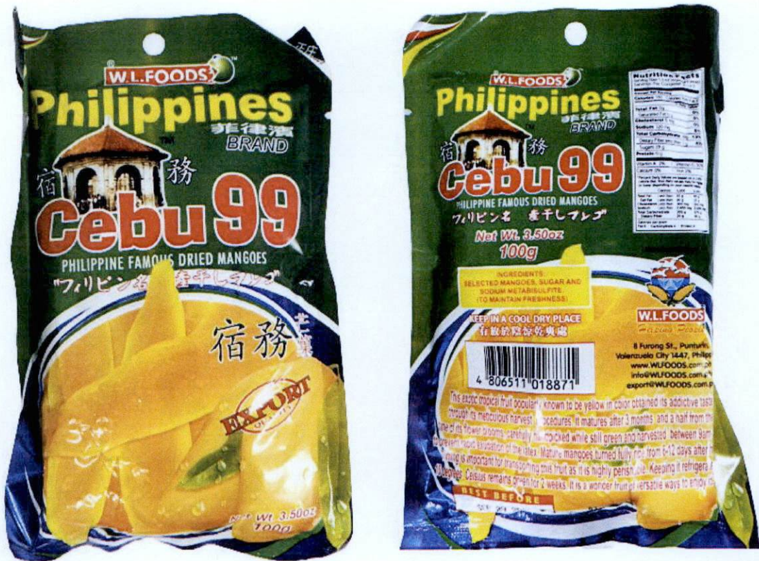
Figure 2. Unregistered W.L FOODS PHILIPPINES BRAND Cebu 99 Dried Mangoes