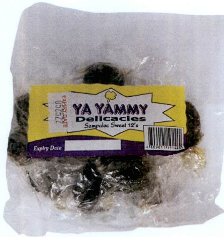
Figure 4. Unregistered YA YAMMY Delicacies Sampaloc Sweet

The FDA verified through online monitoring or post-marketing surveillance that the abovementioned food products are not registered and no corresponding Certificates of Product Registration (CPR) have been issued. Pursuant to the Republic Act No. 9711, otherwise known as the “Food and Drug Administration Act of 2009”, the manufacture, importation, exportation, sale, offering for sale, distribution, transfer, non-consumer use, promotion, advertising or sponsorship of health products without the proper authorization is prohibited.