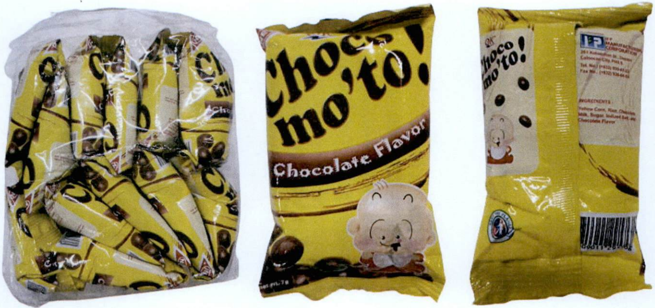
Figure 2. Unregistered OK CHOCO MO'TO! Chocolate Flavor