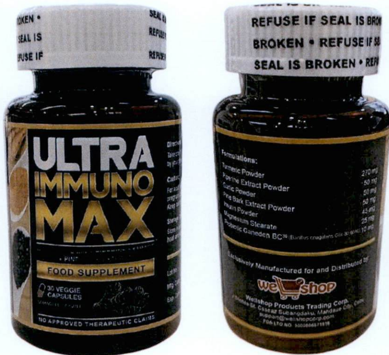
Figure 3. Unregistered ULTRA IMMUNOMAX with Curcumin + Piperine Extract + Pine Bark Extract Food Supplement