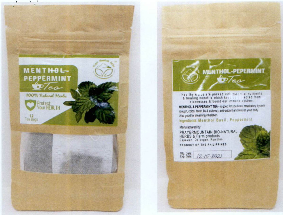
Figure 4. Unregistered PRAYER MOUNTAIN HERBS Menthol Peppermint Tea

The FDA verified through online monitoring or post-marketing surveillance that the abovementioned food products are not registered and no corresponding Certificates of Product Registration (CPR) have been issued. Pursuant to the Republic Act No. 9711, otherwise known as the “Food and Drug Administration Act of 2009”, the manufacture, importation, exportation, sale, offering for sale, distribution, transfer, non-consumer use, promotion, advertising or sponsorship of health products without the proper authorization is prohibited.