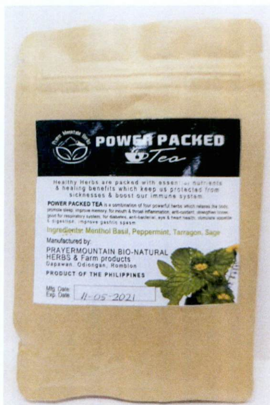
Figure 3. Unregistered PRAYER MOUNTAIN HERBS Power Packed Tea