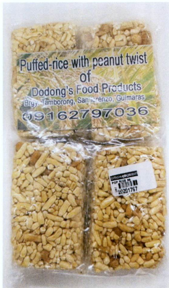
Figure 1. Unregistered DODONG'S FOOD PRODUCTS Puffed Rice with Peanut Twist

The Food and Drug Administration (FDA) warns all healthcare professionals and the general public NOT TO PURCHASE AND CONSUME the following unregistered food products: