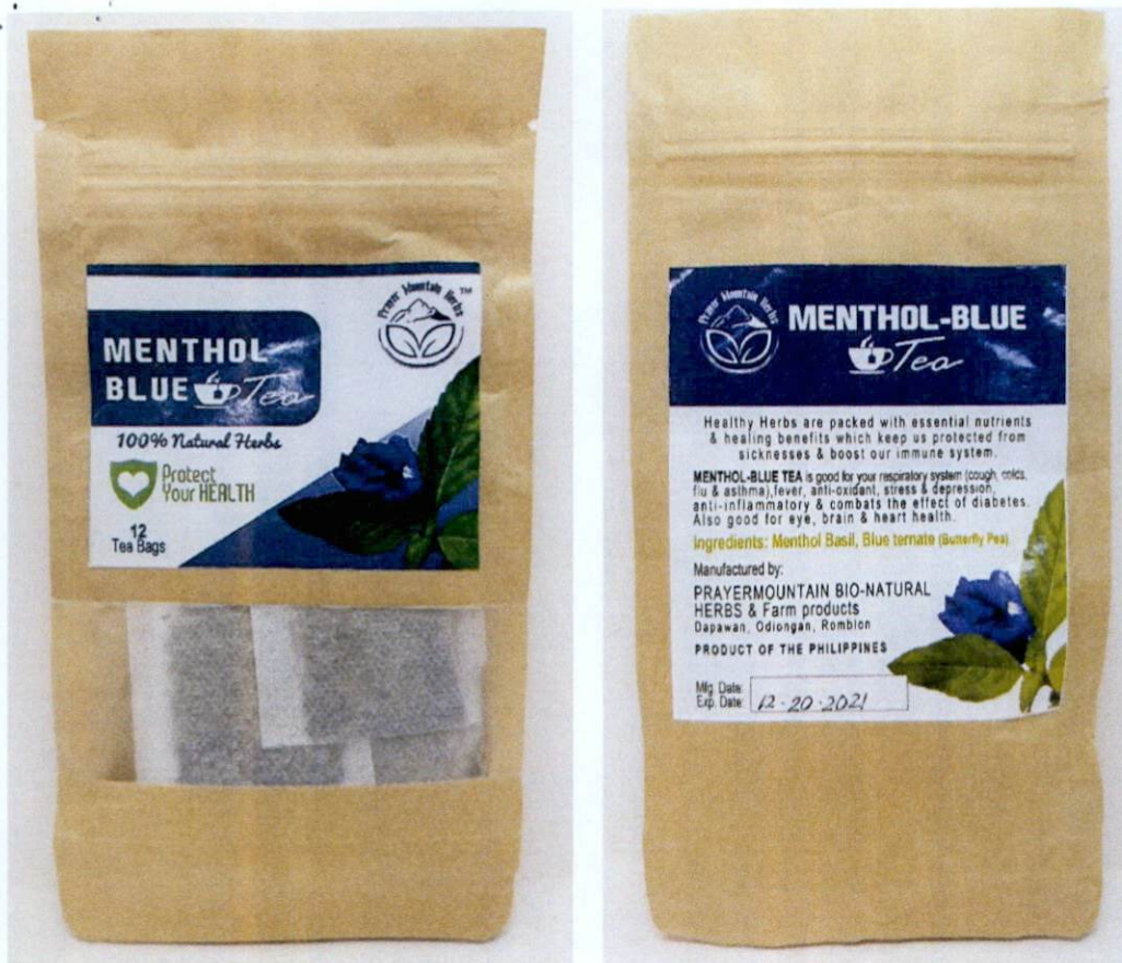
Figure 2. Unregistered PRAYER MOUNTAIN HERBS Menthol Blue Tea