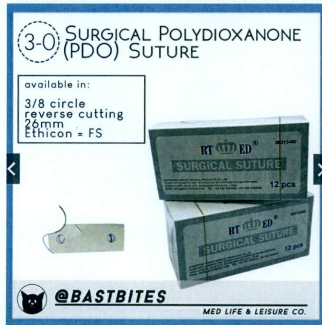
Figure 1. Unregistered RTMED® Surgical Sutures Polydioxanone