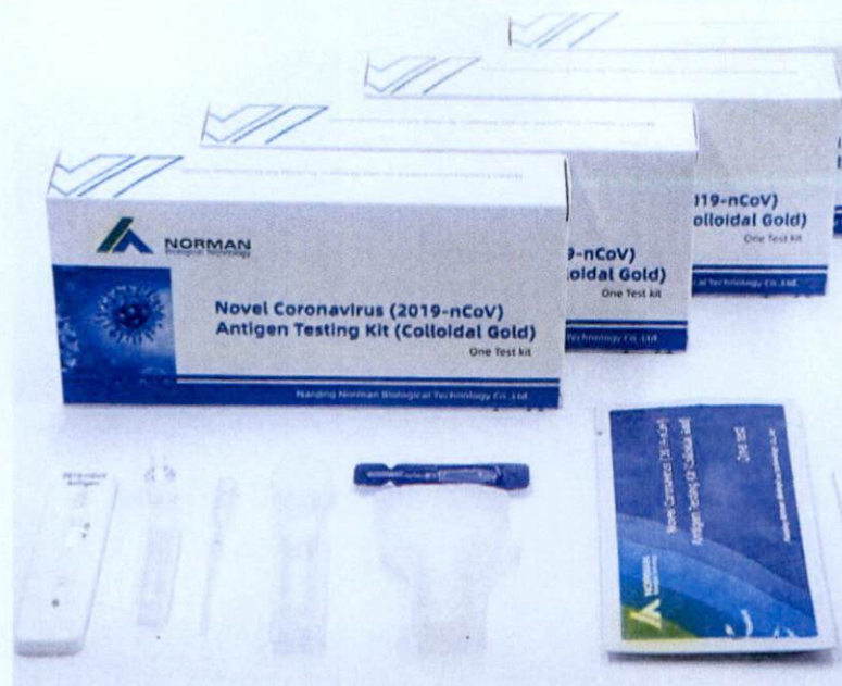
Figure 1. Uncertified Norman Biological Technology Novel Corona Virus (2019-nCoV) Antigen Testing Kit (Colloidal Gold)

The Food and Drug Administration (FDA) warns all healthcare professionals and the general public NOT TO PURCHASE AND USE the uncertified COVID-19 test kit: