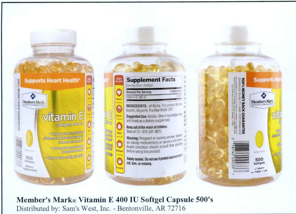
Member's Mark® Vitamin E 400 IU Softgel Capsule 500's Distributed by: Sam's West, Inc. - Bentonville, AR 72716