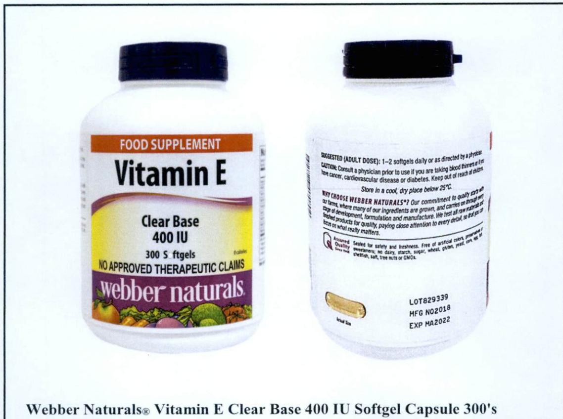
Webber Naturals® Vitamin E Clear Base 400 IU Softgel Capsule 300's

The Food and Drug Administration (FDA) advises the public against the purchase and use of the following unregistered drug products: