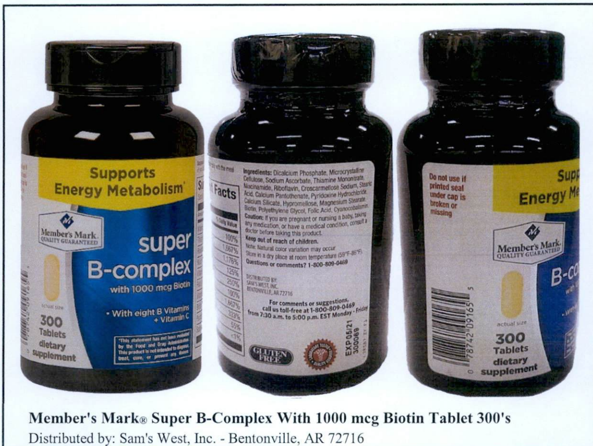
Member's Mark® Super B-Complex With 1000 mcg Biotin Tablet 300's Distributed by: Sam's West, Inc. - Bentonville, AR 72716