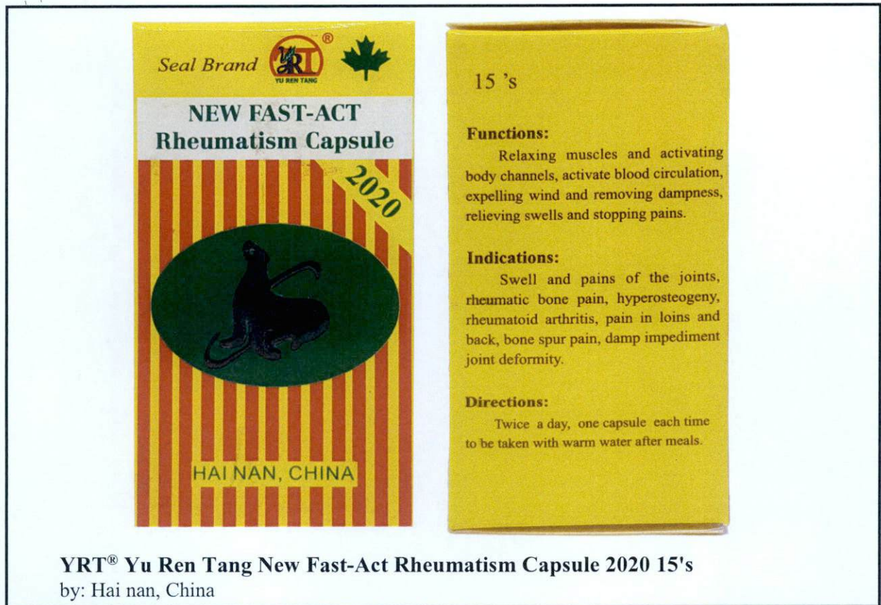
YRT® Yu Ren Tang New Fast-Act Rheumatism Capsule 2020 15's by: Hai nan, China