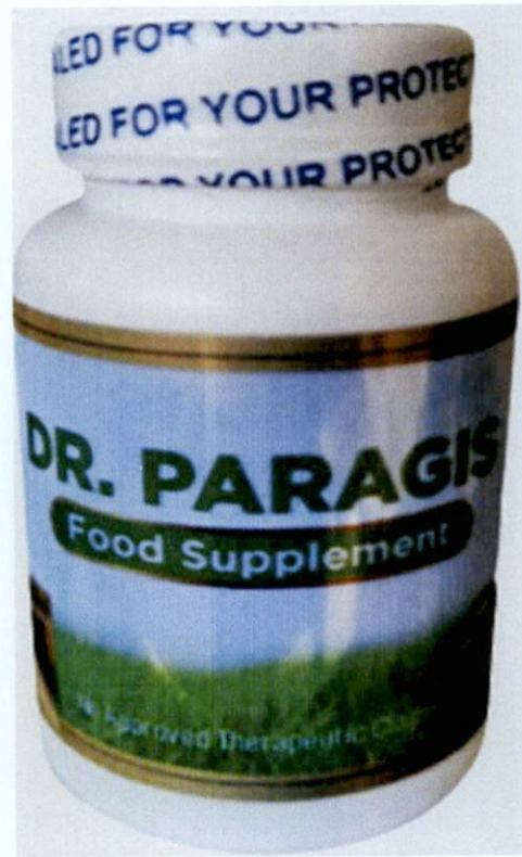
Figure 3. Unregistered DR. PARAGIS Food Supplement