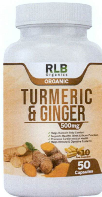
Figure 1. Unregistered RLB ORGANICS Turmeric & Ginger Food Supplement 500mg

The Food and Drug Administration (FDA) warns all healthcare professionals and the general public NOT TO PURCHASE AND CONSUME the following unregistered food supplements: