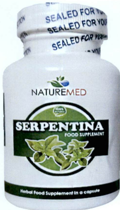
Figure 4. Unregistered NATUREMED Serpentina Food Supplement