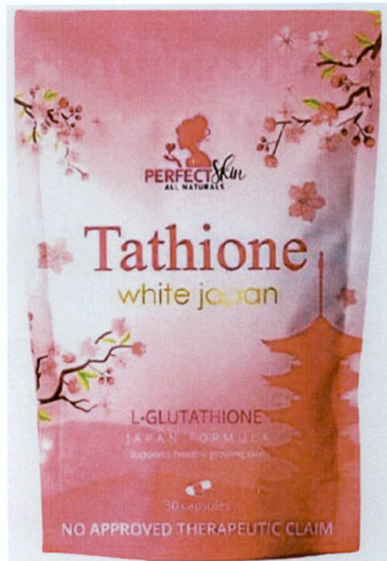
Figure 5. Unregistered PERFECT SKIN Tathione L-Glutathione, 30 Capsules