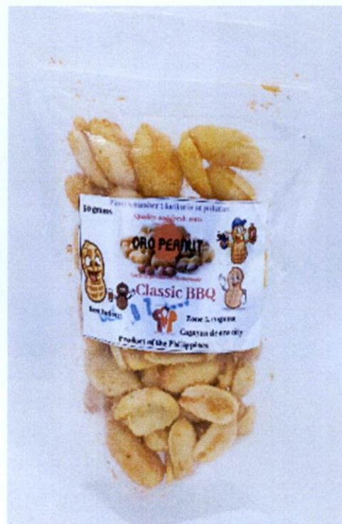
Figure 4. Unregistered ORO Peanut Classic Bbq, 50grams