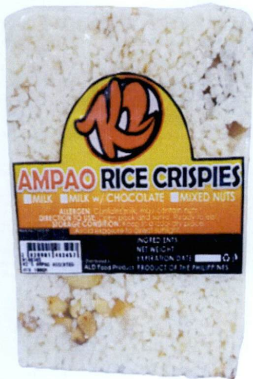
Figure 3. Unregistered K2 Ampao Rice Crispies – Assorted Mix, Net Wt. 100g