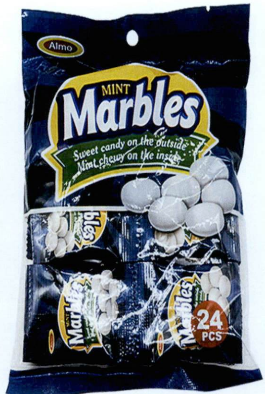
Figure 3. Unregistered ALMO Mint Marbles, 24pcs.