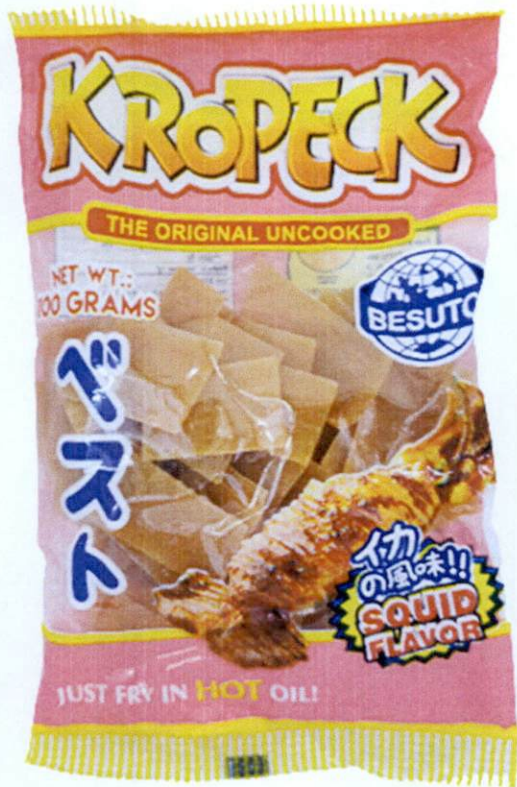
Figure 2. Unregistered BESUTO Krokeck Squid Flavor, Net Wt. 100 Grams