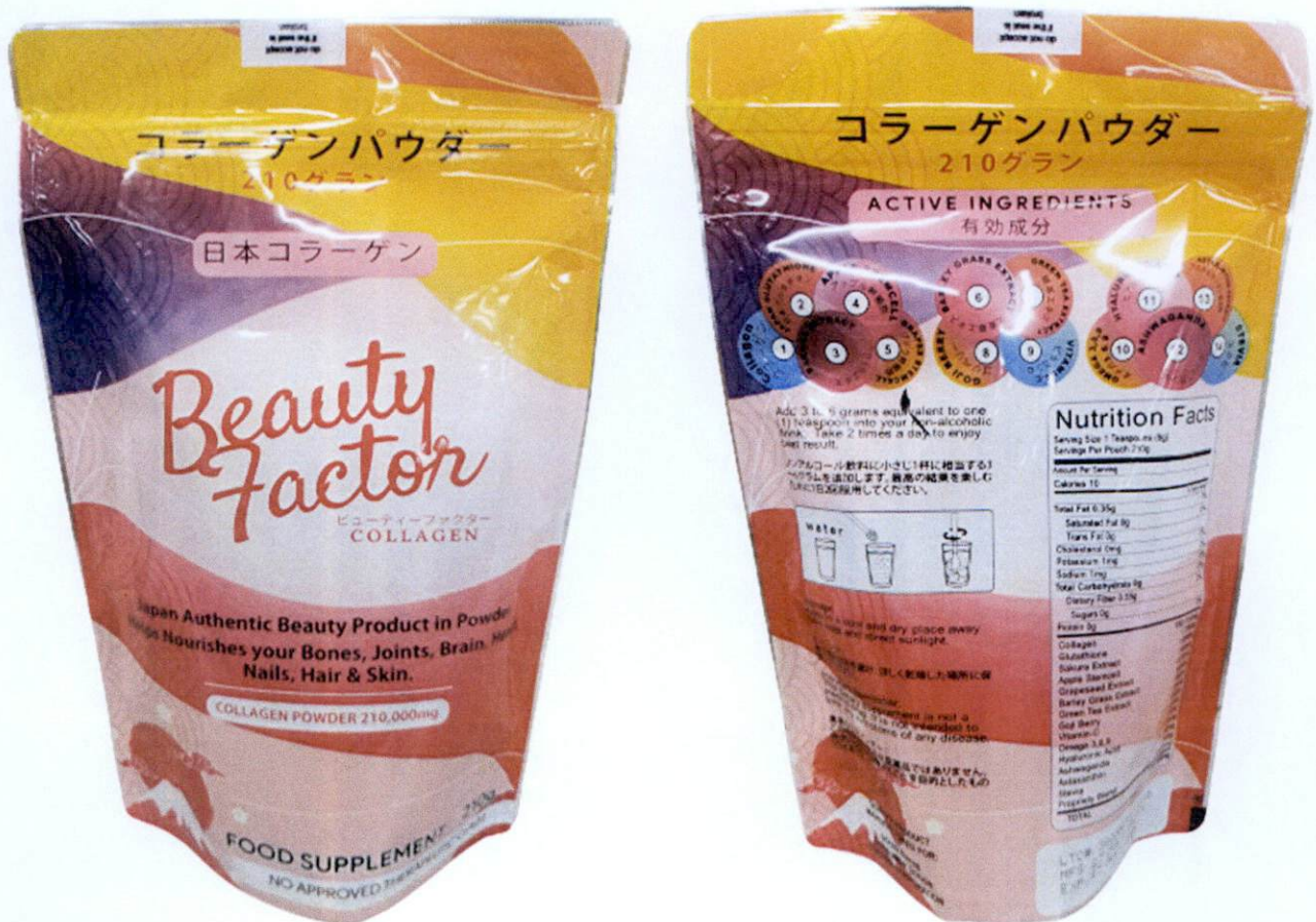
Figure 3. Unregistered BEAUTY FACTOR Collagen Powder Food Supplement