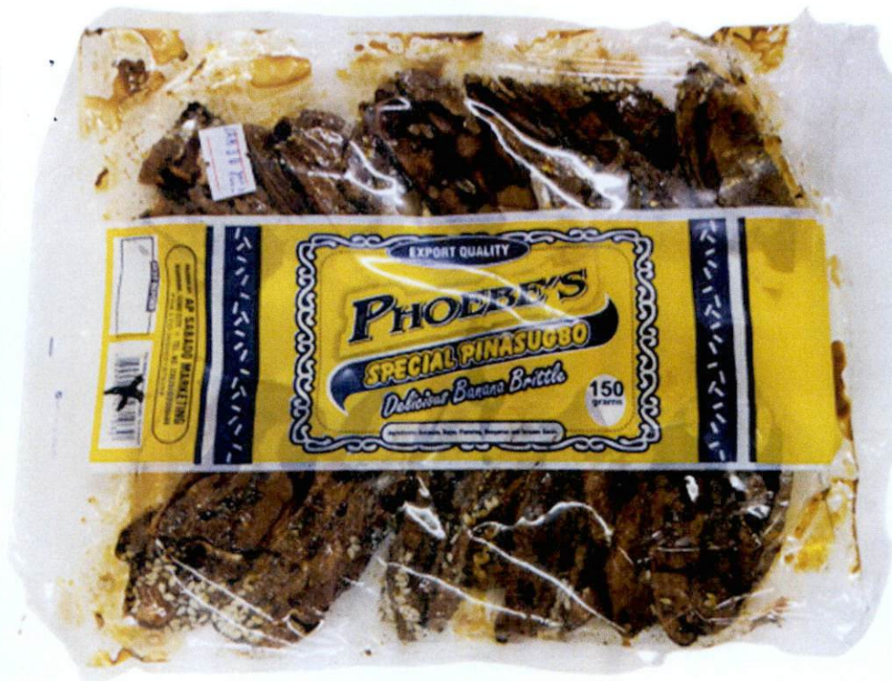
Figure 2. Unregistered PHOEBE'S SPECIAL PINASUGBO Delicious Banana Brittle