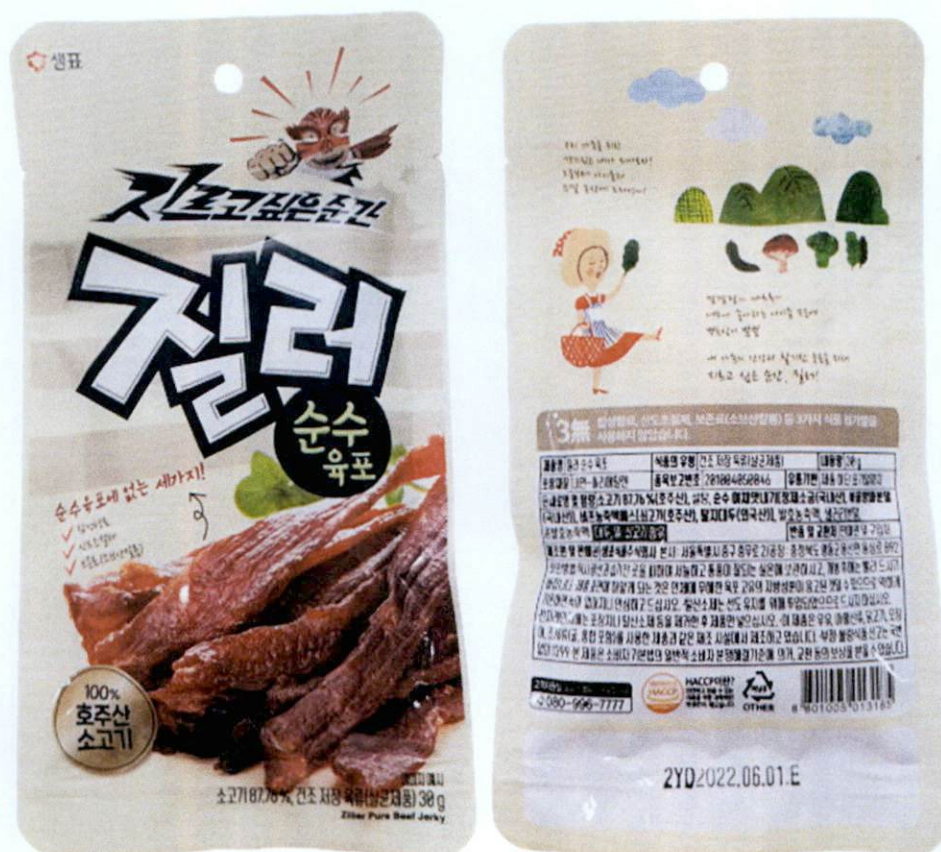
Figure 1. Unregistered Ziller Pure Beef Jerky (In Foreign Language)

The Food and Drug Administration (FDA) warns all healthcare professionals and the general public NOT TO PURCHASE AND CONSUME the following unregistered food products and food supplement: