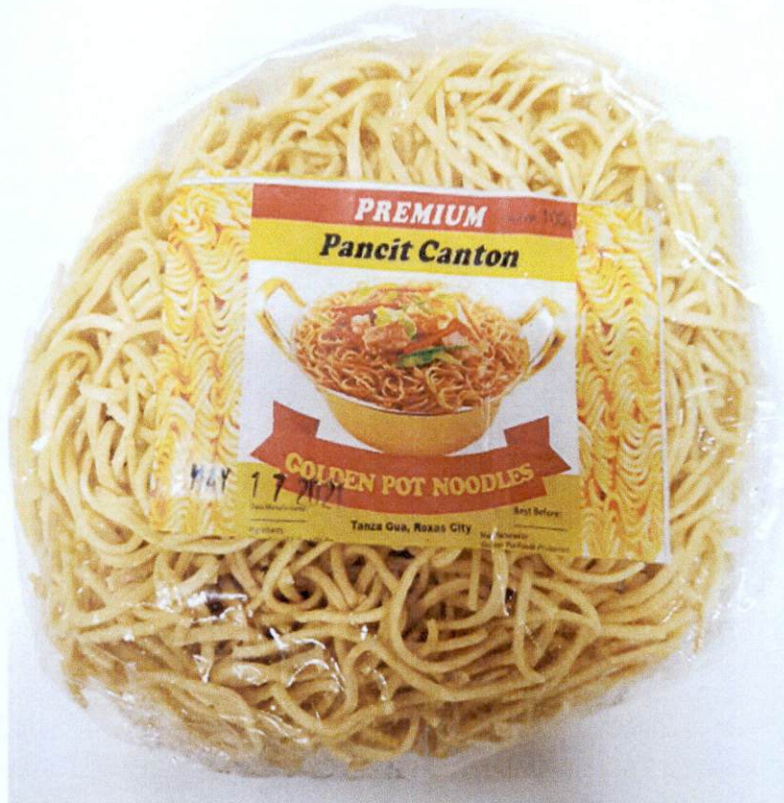
Figure 1. Unregistered GOLDEN POT NOODLES Premium Pancit Canton, Net Wt. 100g

The Food and Drug Administration (FDA) warns all healthcare professionals and the general public NOT TO PURCHASE AND CONSUME the following unregistered food products: