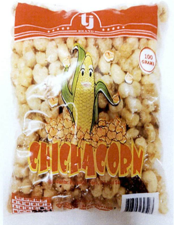
Figure 3. Unregistered TJ BRAND Chichacorn, 100grams