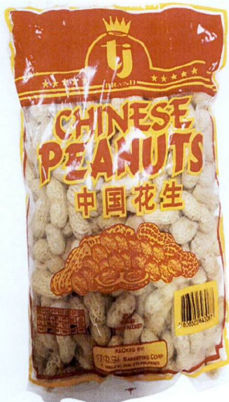
Figure 4. Unregistered TJ BRAND Chinese Peanuts, 250grams