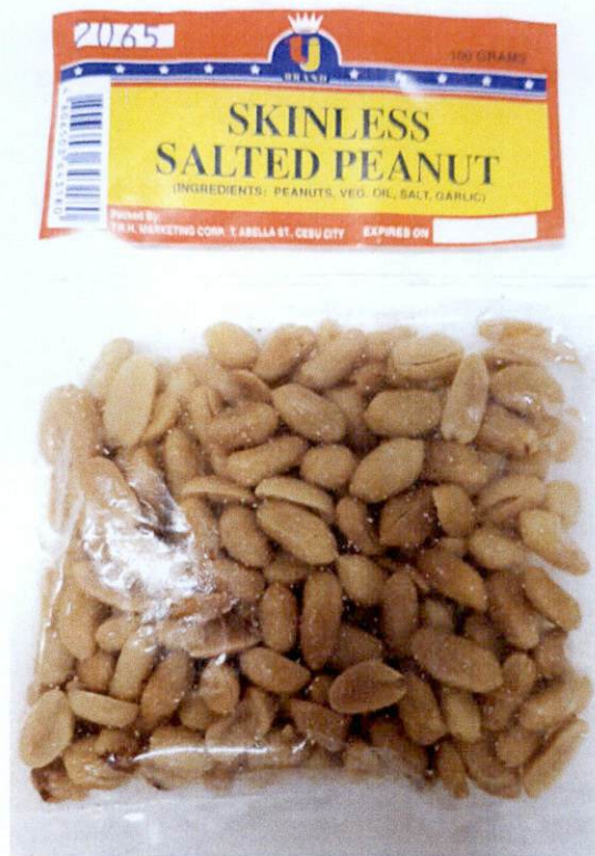
Figure 5. Unregistered TJ BRAND Skinless Salted Peanut, 100grams