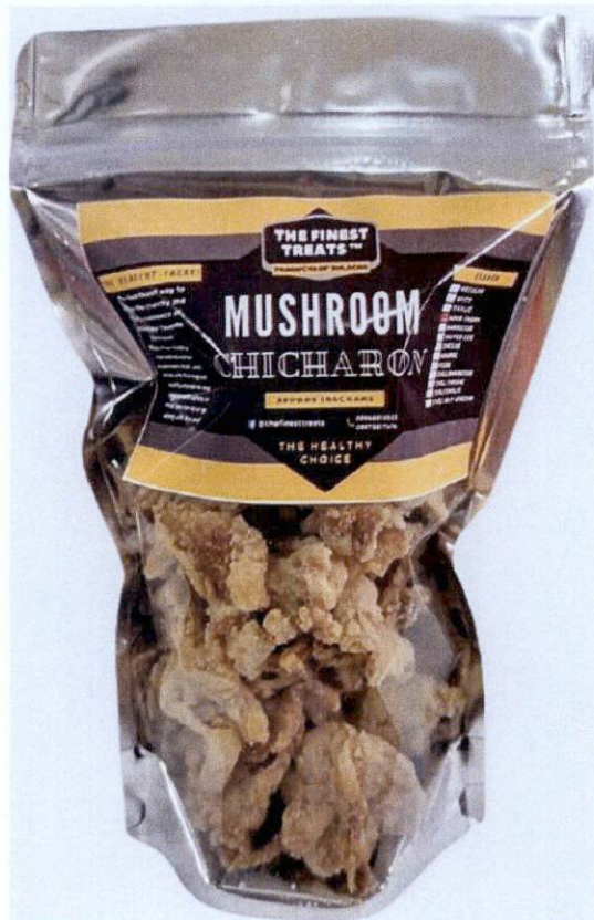
Figure 1. Unregistered THE FINEST TREATS Mushroom Chicharon

The Food and Drug Administration (FDA) warns all healthcare professionals and the general public NOT TO PURCHASE AND CONSUME the following unregistered food products: