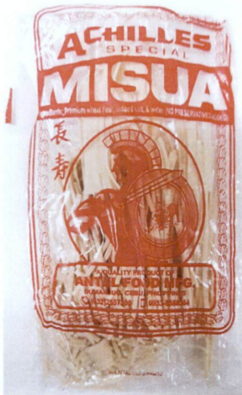
Figure 3. Unregistered ACHILLES Special Misua, 12pcs.