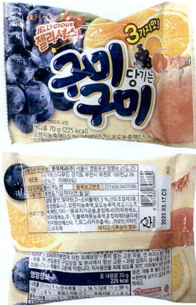
Figure 4. Unregistered LOTTE JELLYCIOUS Jelly & Delicious Food Product with Grapes, Orange, Peach Image in Cream Packaging (In Foreign Language)