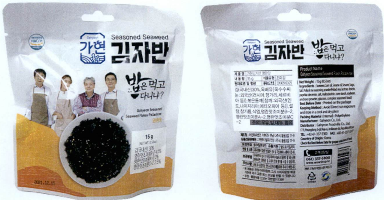
Figure 2. Unregistered GAHYEON Seasoned Seaweed Flakes Pollack Roe (In Foreign Language)