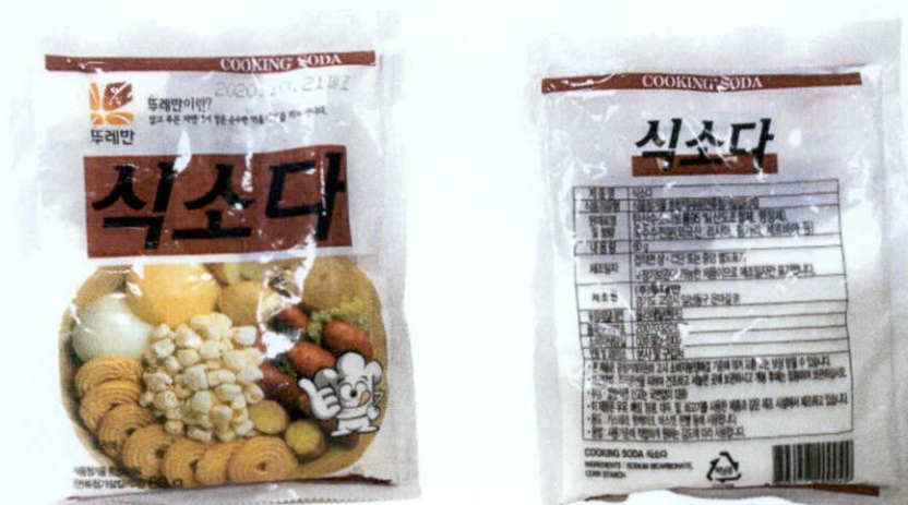
Figure 1. Unregistered Cooking Soda in White Packaging (In Foreign Language)

The Food and Drug Administration (FDA) warns all healthcare professionals and the general public NOT TO PURCHASE AND CONSUME the following unregistered food products: