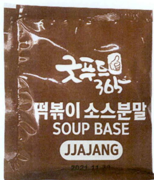
Figure 5. Unregistered 365 Soup Base Jjajang (In Foreign Language)