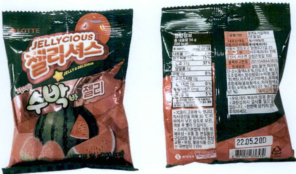
Figure 3. Unregistered LOTTE JELLYCIOUS Jelly & Delicious Food Product with Watermelon Image in Green and Pink Packaging (In Foreign Language)