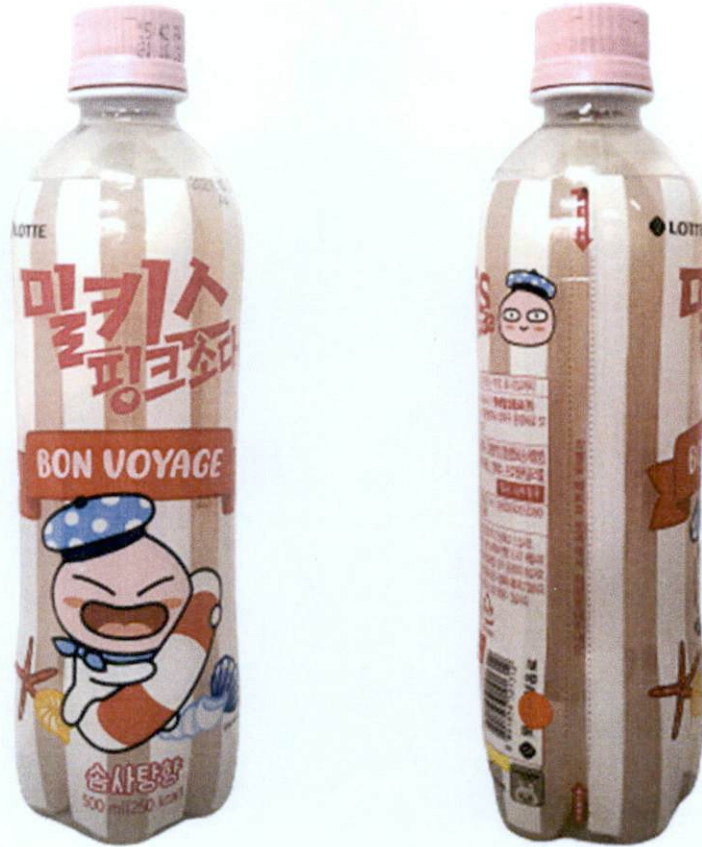
Figure 2. Unregistered LOTTE BON VOYAGE Pink Soda in PET Bottle (In Foreign Language)