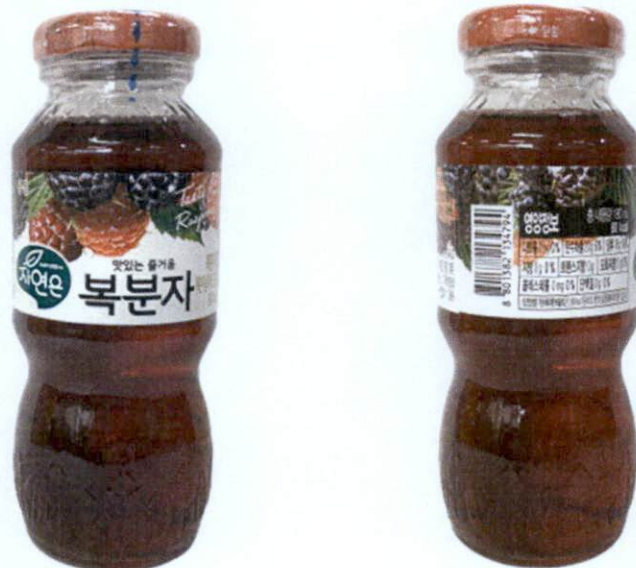
Figure 1. Unregistered NATURE IS Beverage with Raspberry Image in Glass Bottle (In Foreign Language)

The Food and Drug Administration (FDA) warns all healthcare professionals and the general public NOT TO PURCHASE AND CONSUME the following unregistered food products: