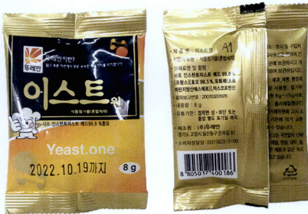
Figure 3. Unregistered Yeast.one in Yellow Orange and Gold Packaging (In Foreign Language)