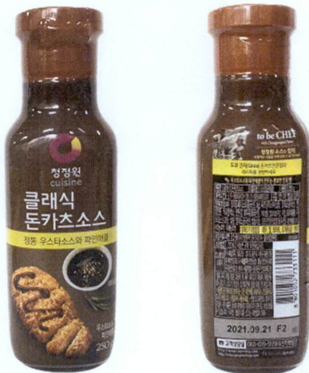
Figure 5. Unregistered CUISINE To Be Chef with Chungjungone Sauce in Brown Plastic Bottle (In Foreign Language)