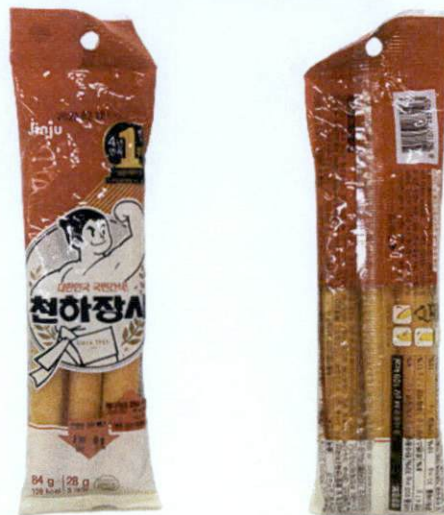
Figure 1. Unregistered JINJU Sausage in Red and White Packaging (In Foreign Language)

The Food and Drug Administration (FDA) warns all healthcare professionals and the general public NOT TO PURCHASE AND CONSUME the following unregistered food products: