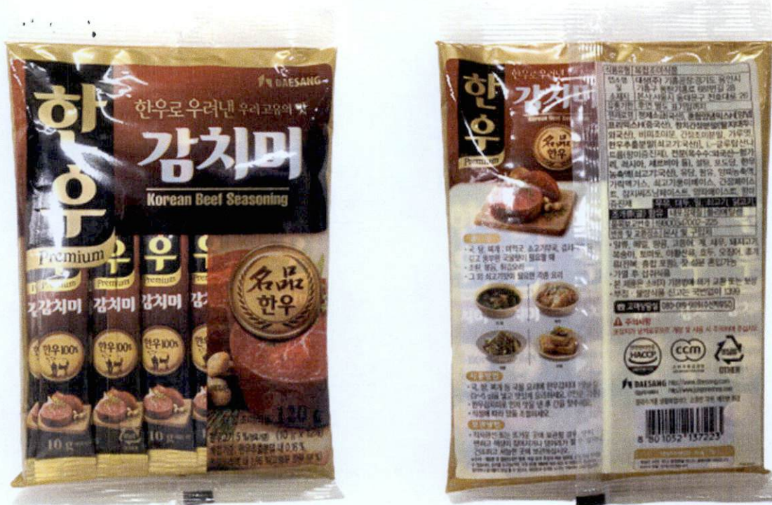
Figure 2. Unregistered DAESANG Korean Beef Seasoning (In Foreign Language)