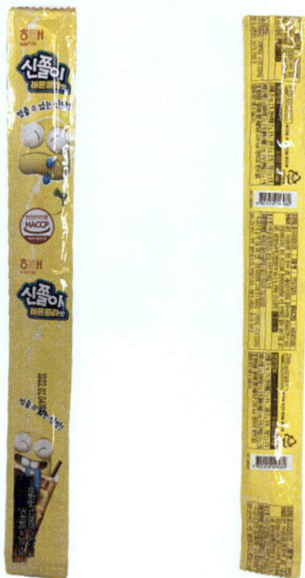
Figure 3. Unregistered HAITAI Candy-Like Product with Lemon Image in Yellow Packaging (In Foreign Language)