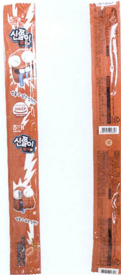
Figure 4. Unregistered HAITAI Candy-Like Product with Strawberry Image in Red Packaging (In Foreign Language)