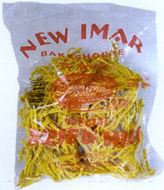
Figure 2. Unregistered NEW IMAR BAKESHOPPE Special Dried Miki