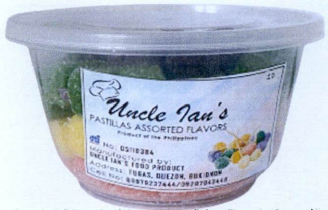
Figure 3. Unregistered UNCLE IAN'S Pastillas Assorted Flavors