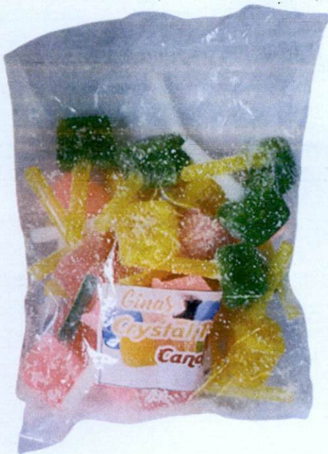
Figure 4. Unregistered GINA Crystal Pop Candy