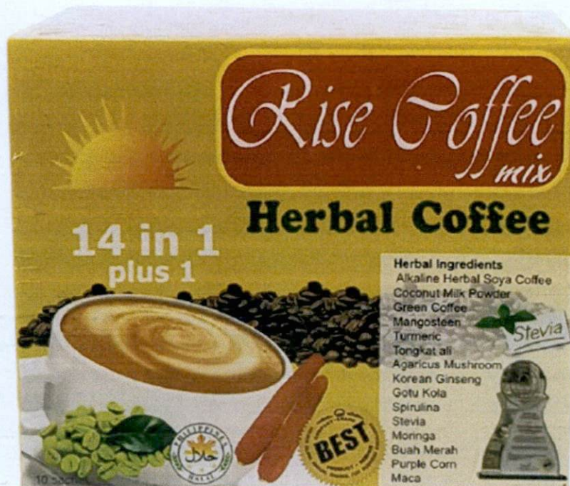
Figure 1. Unregistered RISE COFFEE MIX 14 in 1 Plus 1 Herbal Coffee

The Food and Drug Administration (FDA) warns all healthcare professionals and the general public NOT TO PURCHASE AND CONSUME the following unregistered food products: