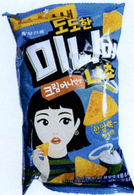
Figure 4. Unregistered Chips in Blue Foil Pouch