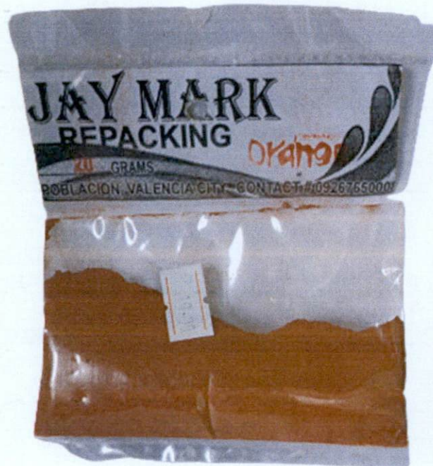
Figure 1. Unregistered JAY MARK REPACKING Orange Powdered Food Color

The Food and Drug Administration (FDA) warns all healthcare professionals and the general public NOT TO PURCHASE AND CONSUME the following unregistered food products: