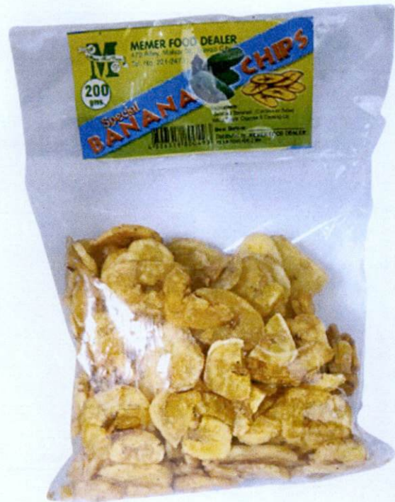
Figure 3. Unregistered MEMER FOOD DEALER Special Banana Chips