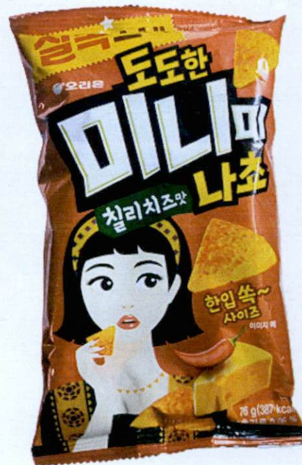
Figure 5. Unregistered Chips in Red Foil Pouch