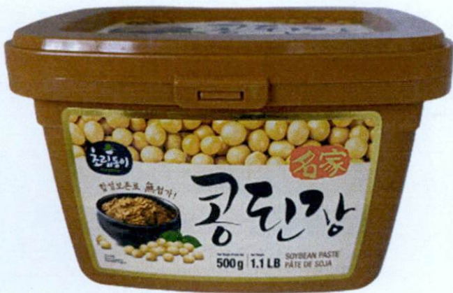
Figure 2. Unregistered CHORIPDONG Soybean Paste