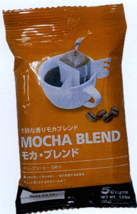
Figure 2. Unregistered Mocha Blend in Orange Packaging with Image of Drip Coffee