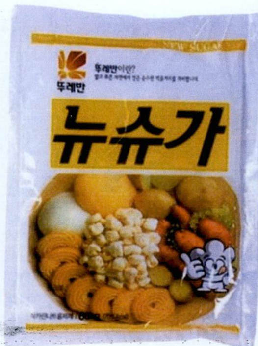
Figure 3. Unregistered New Sugar in White and Orange Colored Packaging