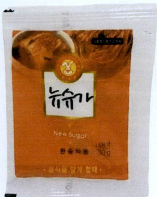
Figure 4. Unregistered New Sugar in White Colored Packaging with Image of Kimchi