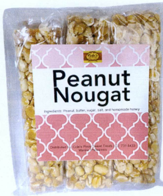
Figure 1. Unregistered COLE'S Peanut Nougat

The Food and Drug Administration (FDA) warns all healthcare professionals and the general public NOT TO PURCHASE AND CONSUME the following unregistered food products: