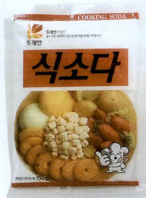
Figure 5. Unregistered Cooking Soda in White and Red Packaging