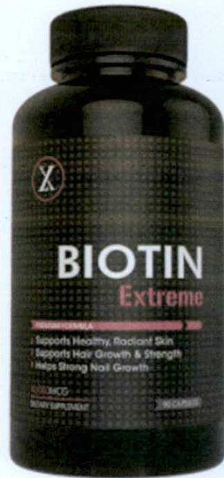
Figure 5. Unregistered LX Biotin Extreme Dietary Supplement