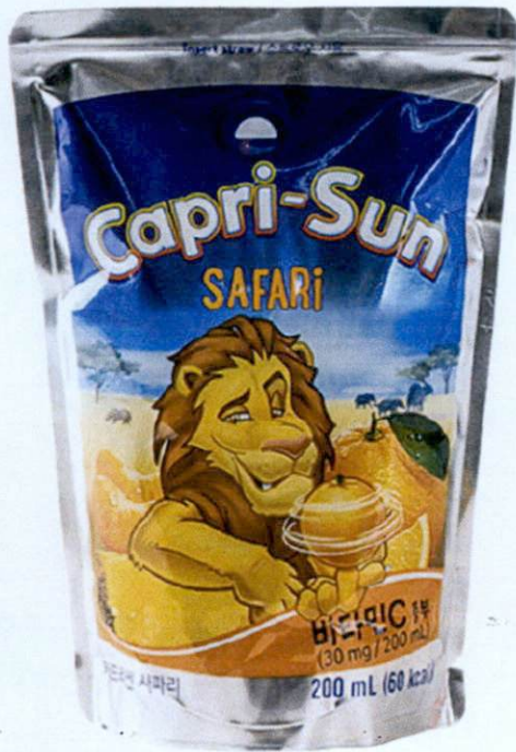
Figure 2. Unregistered CAPRI-SUN Safari Juice Drink