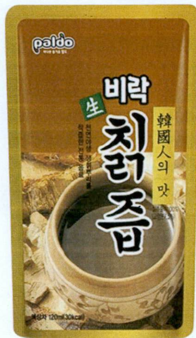
Figure 1. Unregistered PALDO with Image of Coffee in Brown Packaging (In Foreign Language)

The Food and Drug Administration (FDA) warns all healthcare professionals and the general public NOT TO PURCHASE AND CONSUME the following unregistered food products and food supplements: