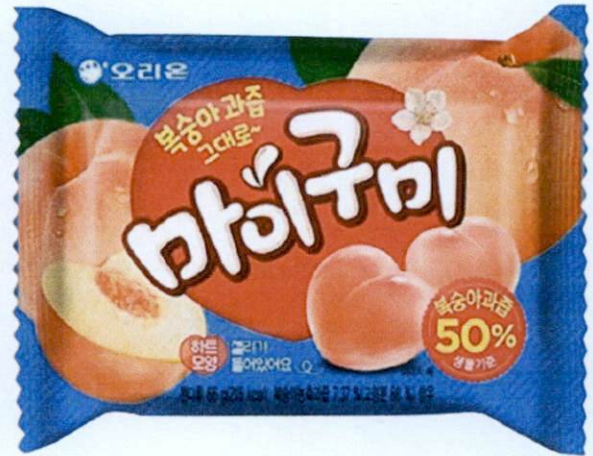
Figure 3. Unregistered Assumed Gummies in Sky Blue Pouch with Image of Peaches (In Foreign Language)