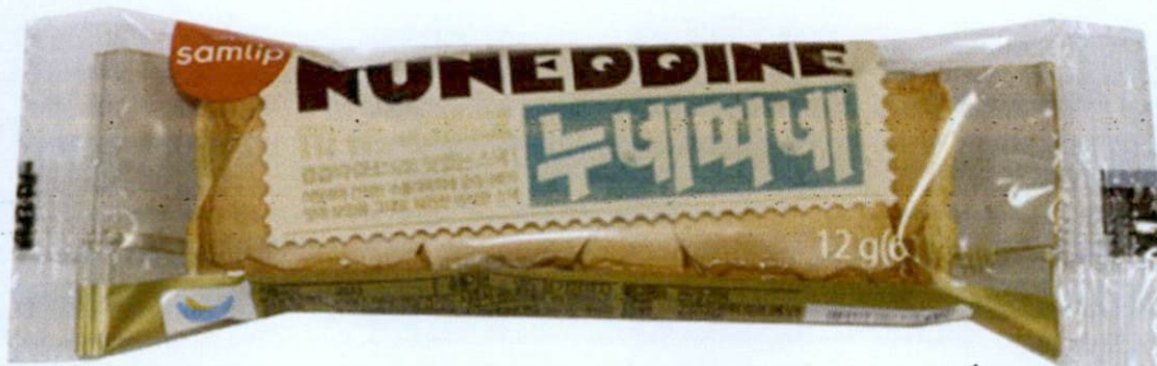
Figure 1. Unregistered SAMLIP Nuneddine Italian Snack

The Food and Drug Administration (FDA) warns all healthcare professionals and the general public NOT TO PURCHASE AND CONSUME the following unregistered food products: