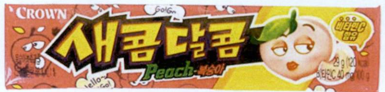
Figure 5. Unregistered CROWN Peach Assumed Bubblegum