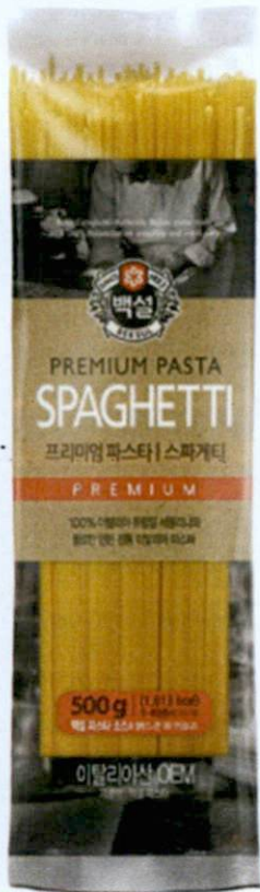
Figure 2. Unregistered BEKSUL Premium Pasta Spaghetti