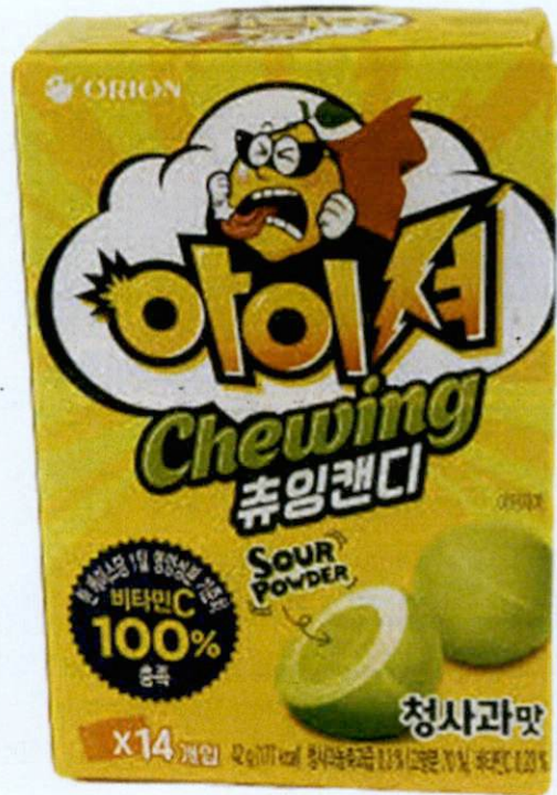
Figure 3. Unregistered ORION Chewing in Yellow Box Sour Powder