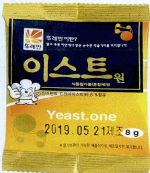
Figure 4. Unregistered Yeast One