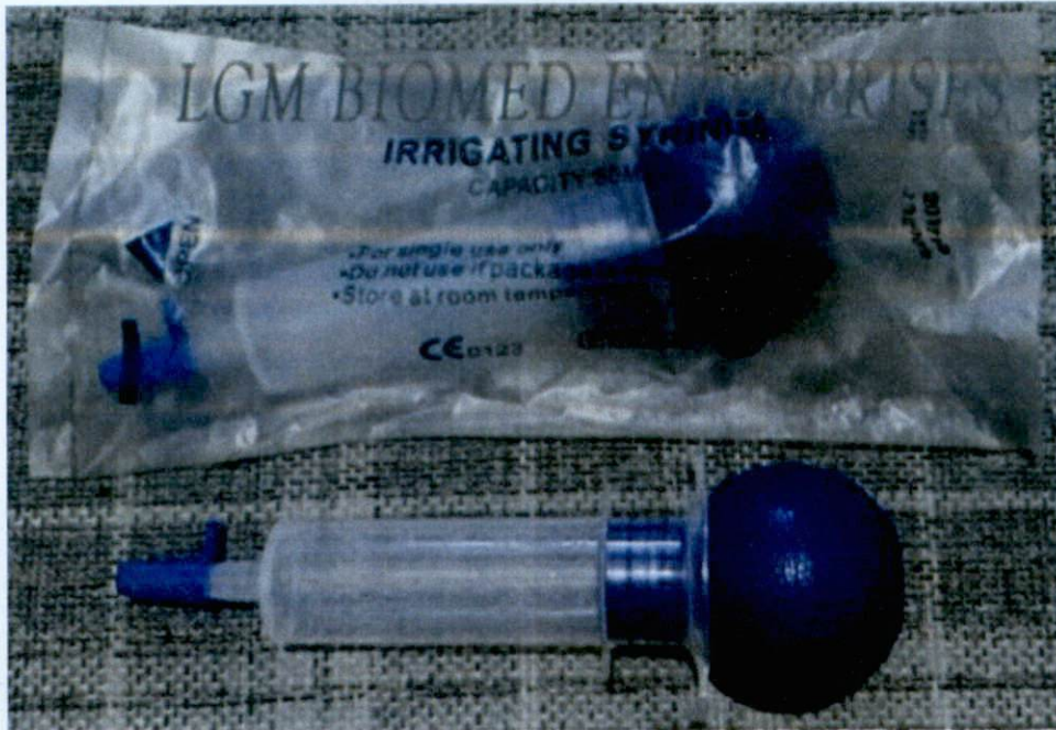
Figure 2. Unnotified LGM Biomed Enterprises Irrigating Syringe

The FDA verified through post-marketing surveillance that the above mentioned medical device products are not notified and no corresponding Product Notification Certificates have been issued. Pursuant to the Republic Act No. 9711, otherwise known as the “Food and Drug Administration Act of 2009”, the manufacture, importation, exportation, sale, offering for sale, distribution, transfer, non-consumer use, promotion, advertising, or sponsorship of health products without the proper authorization are prohibited.