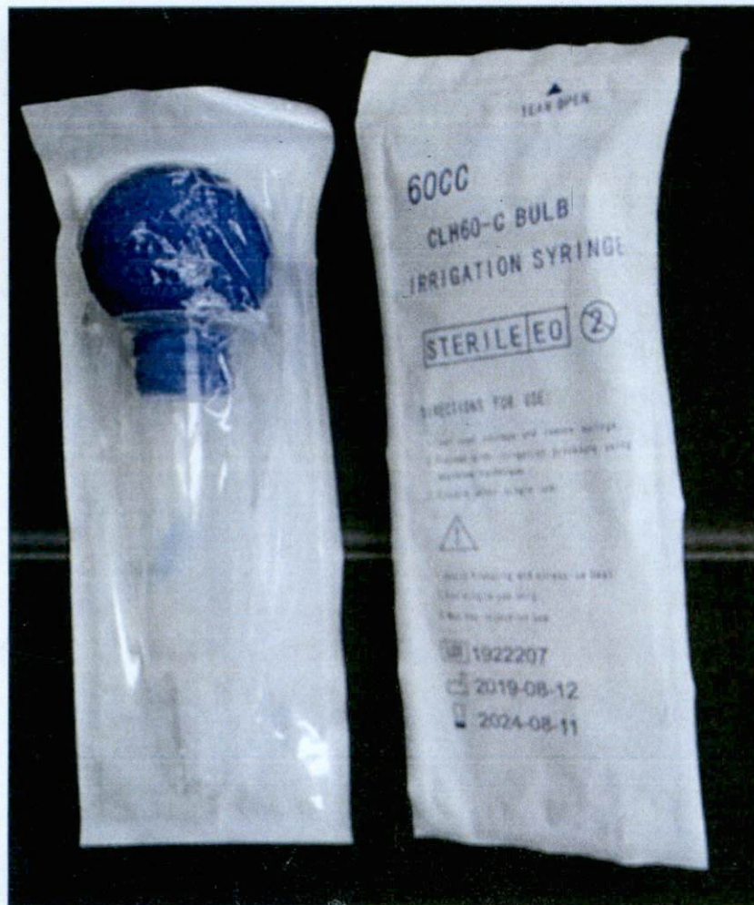
Figure 1. Unnotified CLH60-C Bulb Irrigating Syringe

The Food and Drug Administration (FDA) warns all healthcare professionals and the general public NOT TO PURCHASE AND USE the following unnotified medical device products: