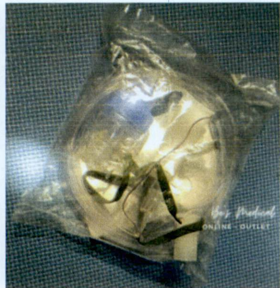
Figure 1. Unregistered Vertex Nebulizer Mask with Chamber and Tubing

The FDA verified through post-marketing surveillance that the above-mentioned medical device product is not registered and no corresponding Product Registration Certificate has been issued. Pursuant to the Republic Act No. 9711, otherwise known as the "Food and Drug Administration Act of 2009", the manufacture, importation, exportation, sale, offering for sale, distribution, transfer, non-consumer use, promotion, advertising or sponsorship of health products without the proper authorization is prohibited.