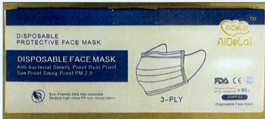
Figure 1. Unnotified Aidelai Disposable Face Mask

The FDA verified through post-marketing surveillance that the above mentioned medical device product is not notified and no corresponding Product Notification Certificate has been issued. Pursuant to the Republic Act No. 9711, otherwise known as the “Food and Drug Administration Act of 2009”, the manufacture, importation, exportation, sale, offering for sale, distribution, transfer, non-consumer use, promotion, advertising or sponsorship of health products without the proper authorization is prohibited.