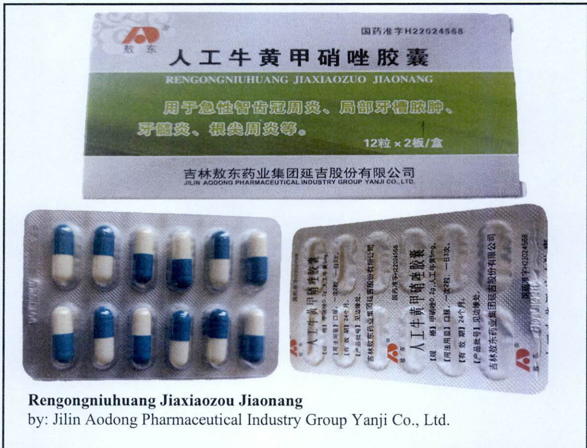
Rengongniuhuang Jiaxiaozou Jiaonang by: Jilin Aodong Pharmaceutical Industry Group Yanji Co., Ltd.

The Food and Drug Administration (FDA) advises the public against the purchase and use of the following unregistered drug products: