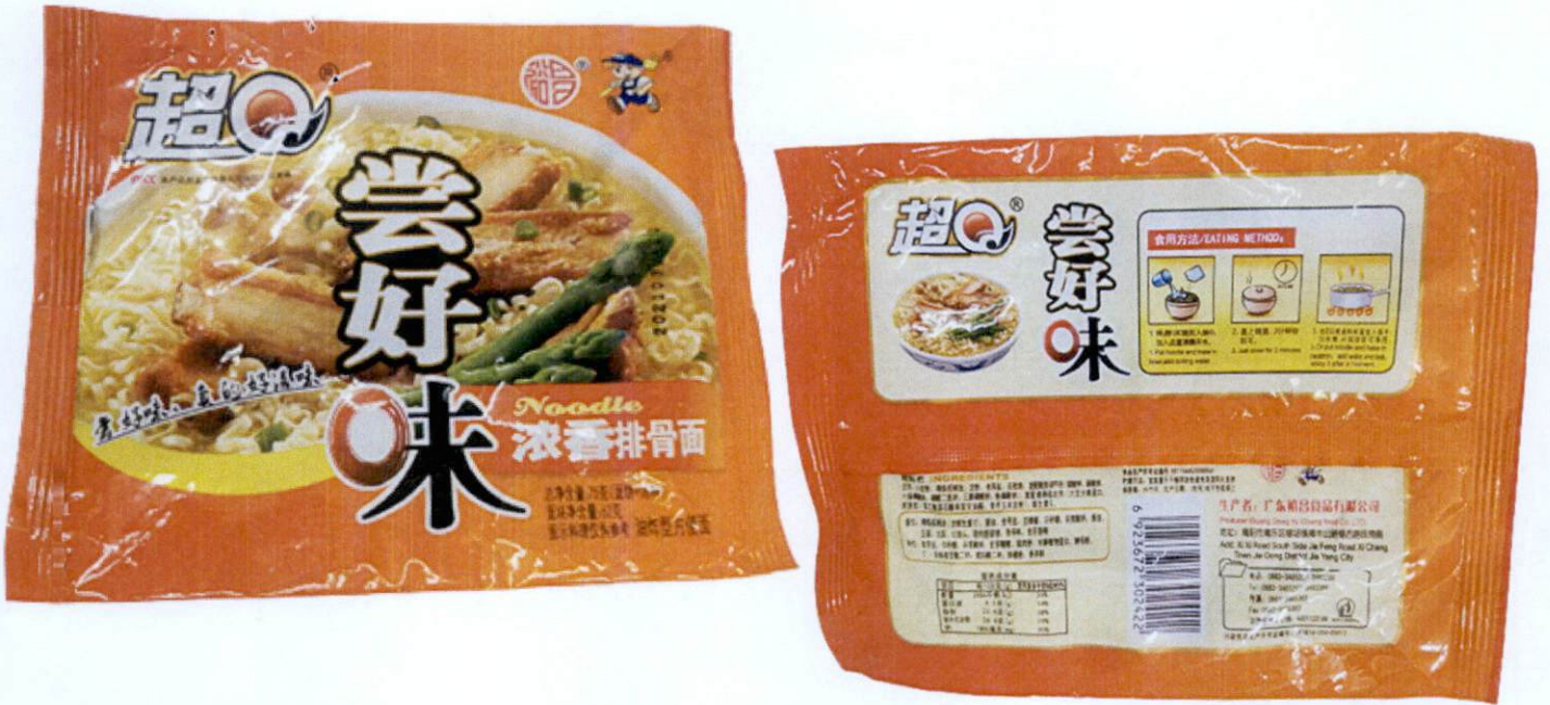
Figure 2. Unregistered NOODLE Instant Noodles in Orange Packaging with Image of Boy and Spareribs (In Foreign Language)