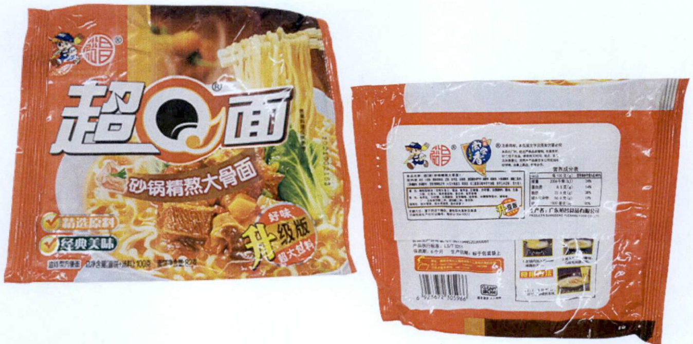
Figure 1. Unregistered Instant Noodles in Red Packaging with Image of Boy and Spareribs (In Foreign Language)

The Food and Drug Administration (FDA) warns all healthcare professionals and the general public NOT TO PURCHASE AND CONSUME the following unregistered food products: