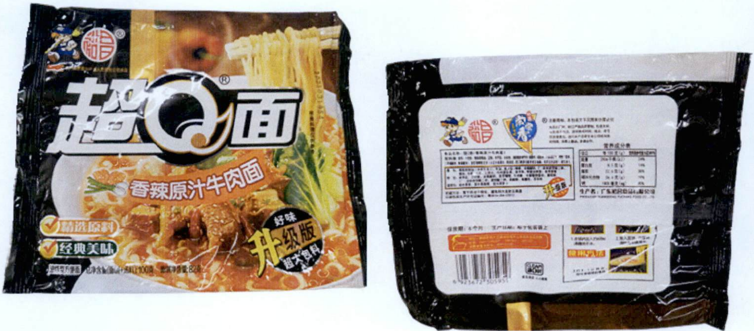
Figure 3. Unregistered Instant Noodles in Black Packaging with Image of Boy and Meat (In Foreign Language)