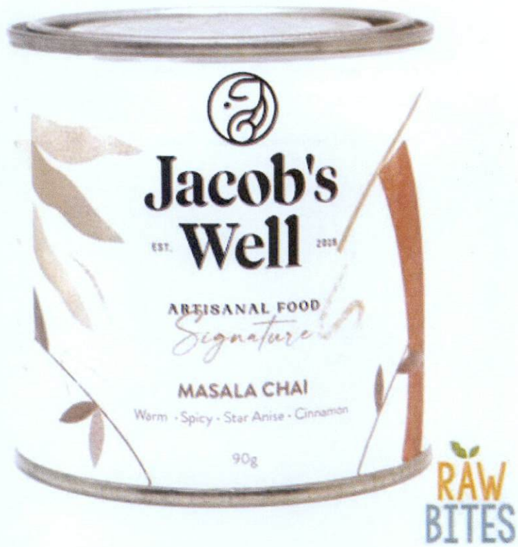
Figure 4. Unregistered JACOB'S WELL Artisanal Food Signature Masala Chai