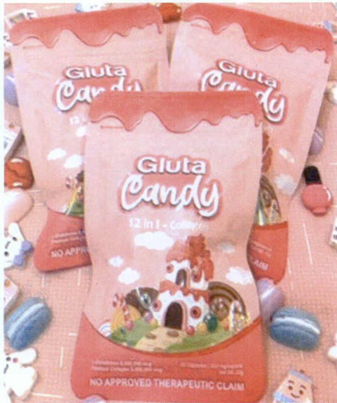
Figure 2. Unregistered GLUTA CANDY 12in1 + Collagen