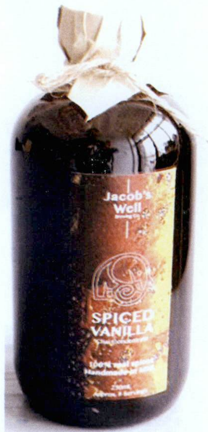
Figure 3. Unregistered JACOB'S WELL Spiced Vanilla Chai Concentrate