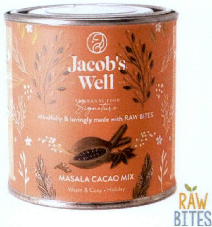
Figure 5. Unregistered JACOB'S WELL Artisanal Food Signature Masala Cacao Mix