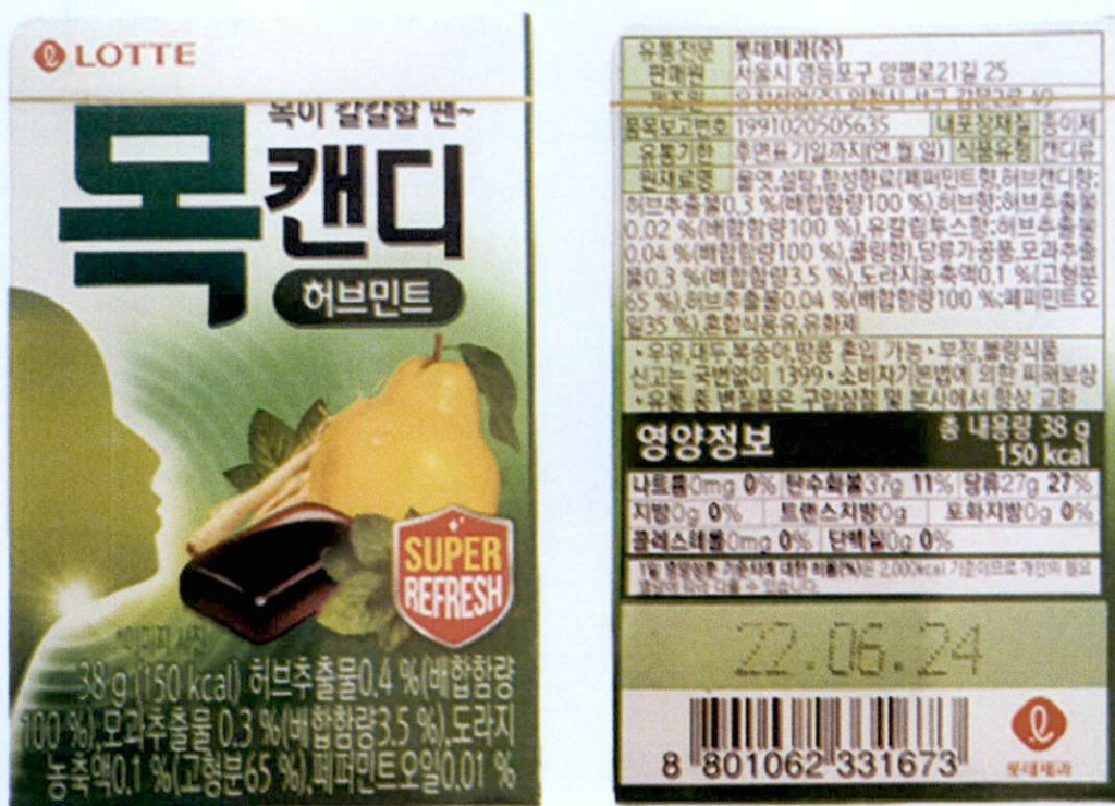
Figure 1. Unregistered LOTTE Candy with Pear and Spearmint Image (In Foreign Language)

The Food and Drug Administration (FDA) warns all healthcare professionals and the general public NOT TO PURCHASE AND CONSUME the following unregistered food products: