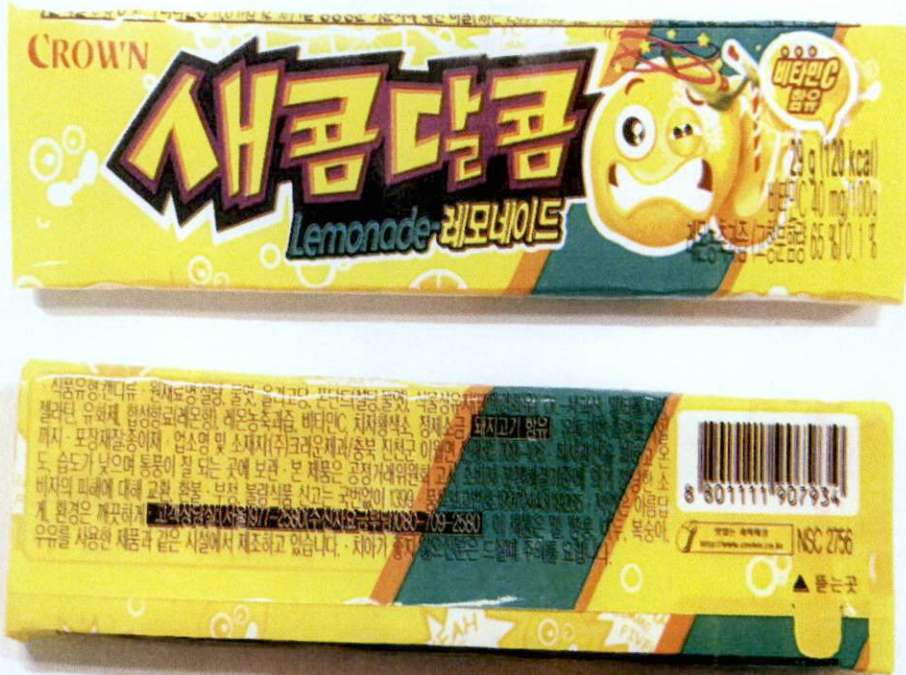
Figure 2. Unregistered CROWN Lemonade Soft Candy (In Foreign Language)