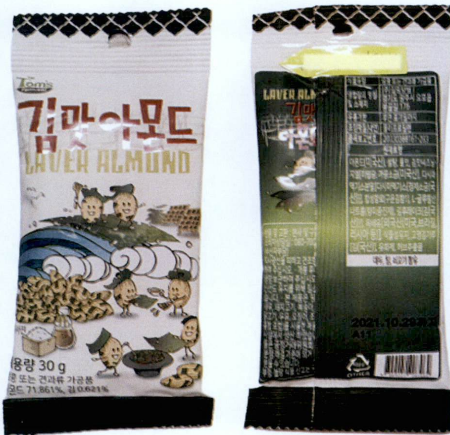
Figure 5. Unregistered TOM'S FARMS Laver Almond (In Foreign Language)