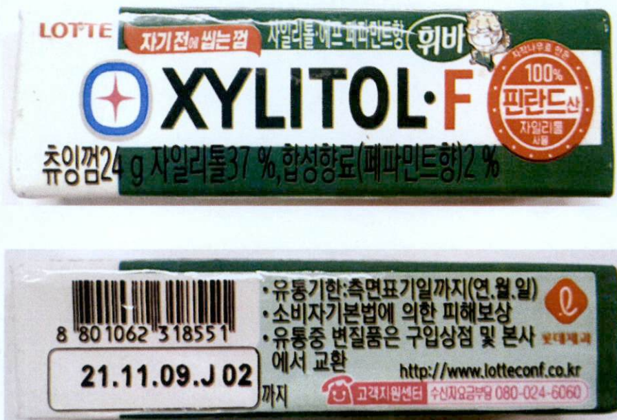
Figure 3. Unregistered LOTTE Xylitol.F Chewing Gum (In Foreign Language)