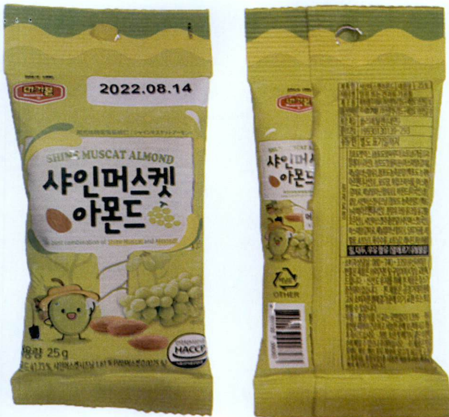
Figure 4. Unregistered MURGERBON Shine Muscat Almond