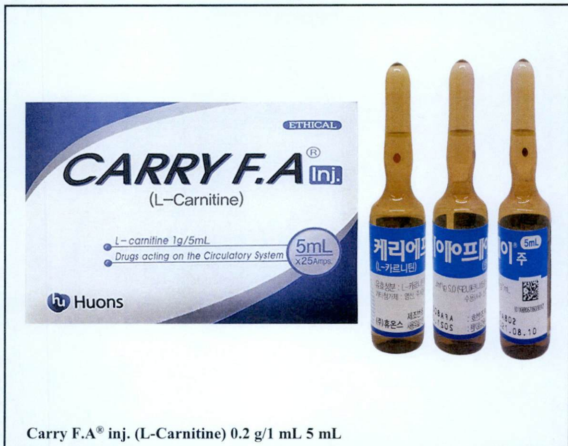
Carry F.A ® inj. (L-Carnitine) 0.2 g/1 mL 5 mL

The Food and Drug Administration (FDA) advises the public against the purchase and use of the following unregistered drug products: