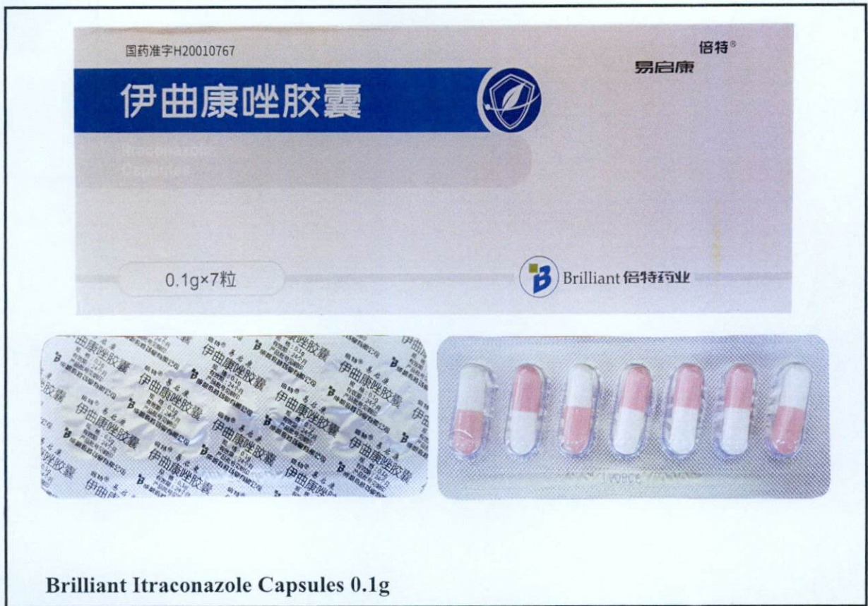
Brilliant Itraconazole Capsules 0.1g