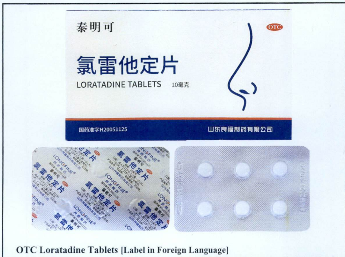
Figure 1. Unregistered drug

The Food and Drug Administration (FDA) advises the public against the purchase and use of the following unregistered drug products: