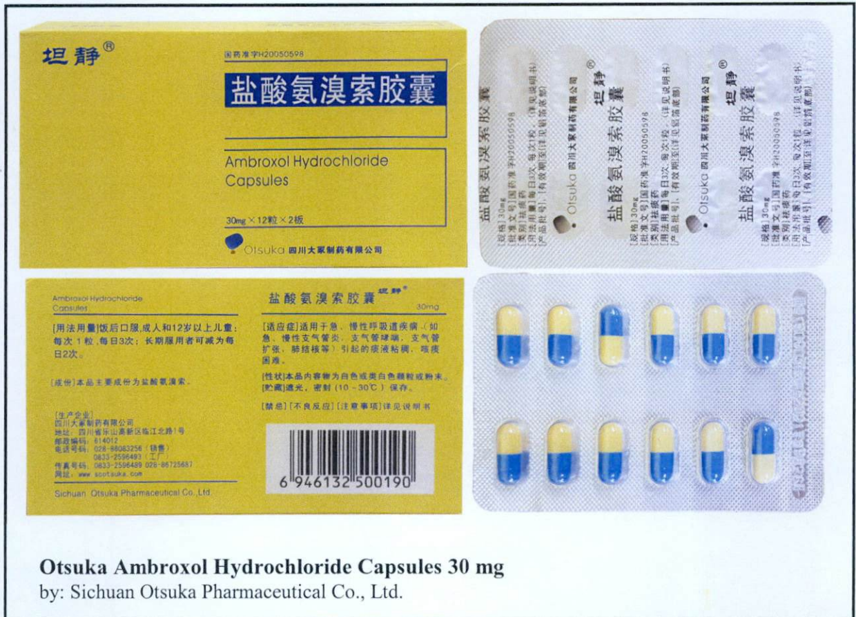
Otsuka Ambroxol Hydrochloride Capsules 30 mg by: Sichuan Otsuka Pharmaceutical Co., Ltd.