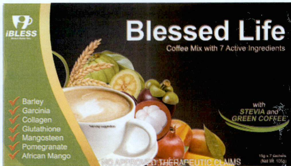
Figure 1. Approved label of BLESSED LIFE Coffee Mix with Herbal Extracts, FR-4000008120733 issued on 23 November 2021

The Food and Drug Administration (FDA) informs the public that the food product BLESSED LIFE Coffee Mix 7 Active Ingredients with Stevia and Green Coffee has been registered by the Market Authorization Holder (MAH) iBLESS DIRECT SALES INC. in accordance to existing FDA rules and regulations.