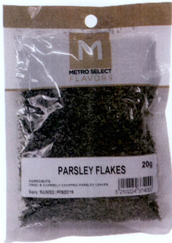
Figure 1. The Approved label of METRO SELECT FLAVORS Parsley Flakes with registration number FR- 4000008690386 valid until 23 November 2026 .

The Food and Drug Administration (FDA) informs the public that the following food product PARSLEY FLAKES is now registered by the Market Authorization Holder (MAH) METRO SELECT FLAVORS in accordance to existing FDA rules and regulations.