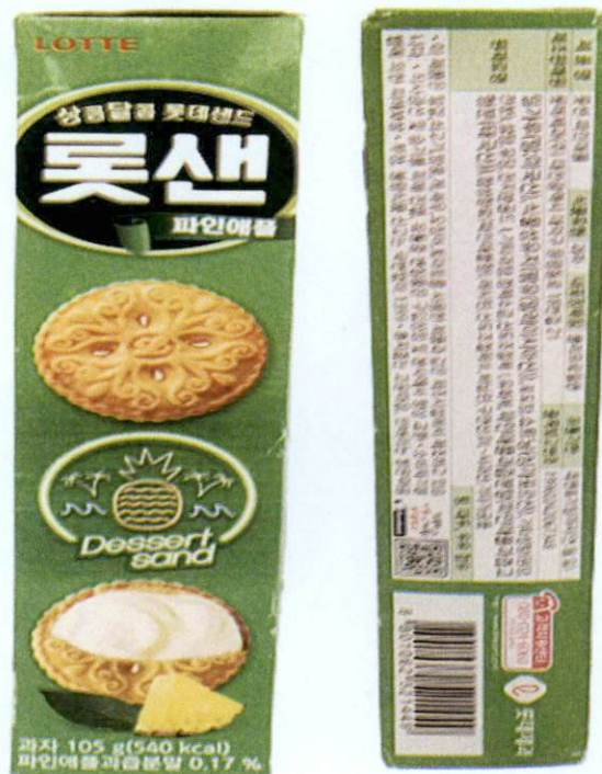
Figure 1. Unregistered LOTTE DESSERT SAND Biscuit with Pineapple Image in Green Carton Box (In Foreign Language)

The Food and Drug Administration (FDA) warns all healthcare professionals and the general public NOT TO PURCHASE AND CONSUME the following unregistered food products: