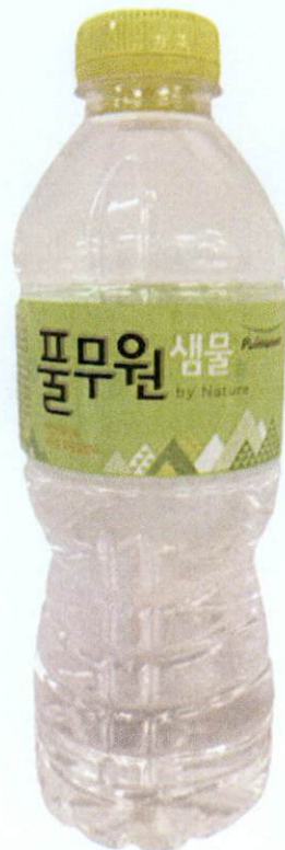
Figure 4. Unregistered PULMOUNE BY NATURE Drinking Water in PET Bottle with Green Label (In Foreign Language)