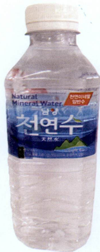
Figure 3. Unregistered Natural Mineral Water in PET Bottle with Blue Label (In Foreign Language)