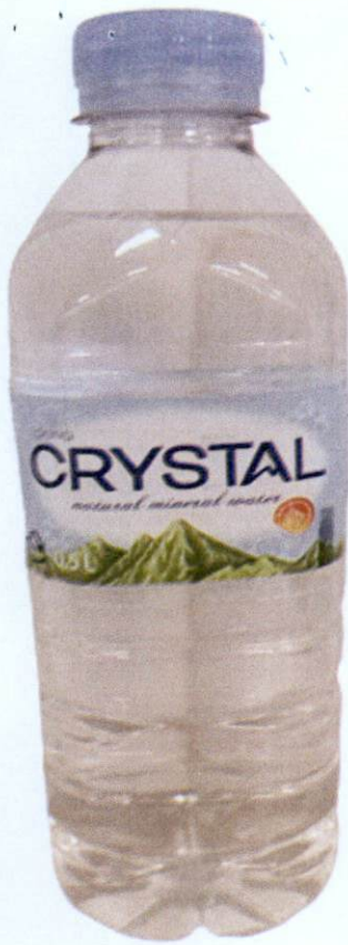
Figure 2. Unregistered IDONG CRYSTAL Natural Mineral Water (In Foreign Language)