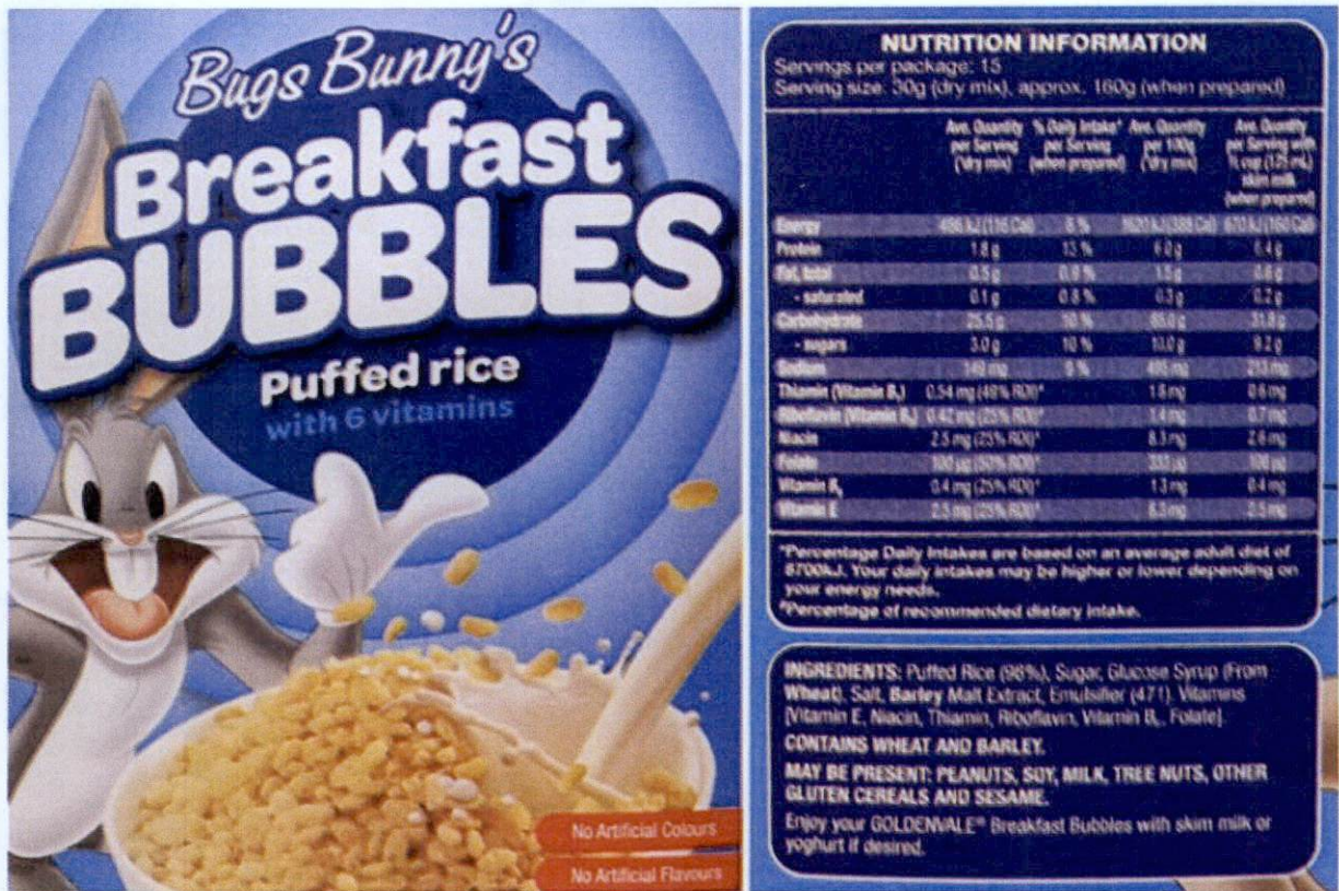
Figure 2. Unregistered BUGS BUNNY'S Breakfast Bubbles Puffed Rice