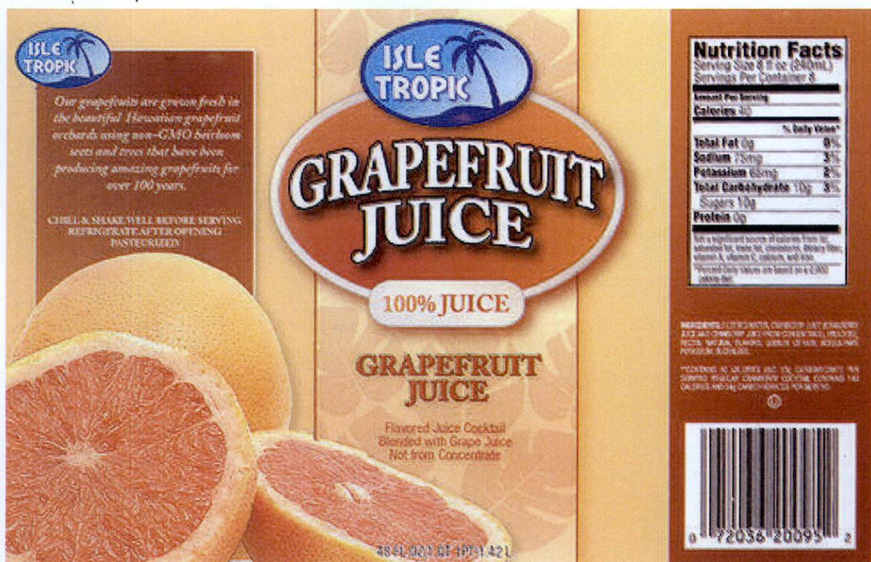
Figure 4. Unregistered ISLE TROPIC Grapefruit Juice