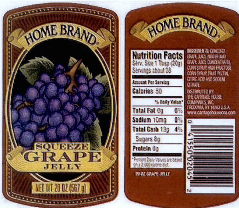
Figure 3. Unregistered HOME BRAND Squeeze Grape Jelly