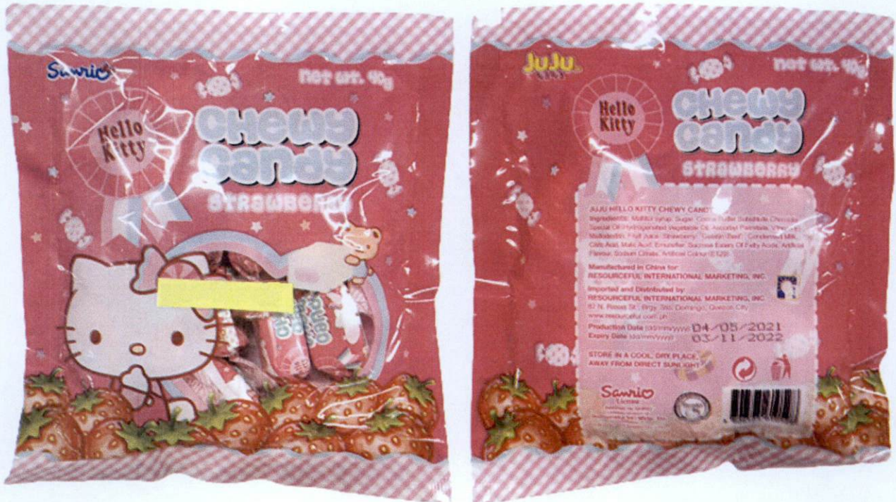
Figure 1. Unregistered JUJU HELLO KITTY Chewy Candy Strawberry

The Food and Drug Administration (FDA) warns all healthcare professionals and the general public NOT TO PURCHASE AND CONSUME the following unregistered food products and food supplement: