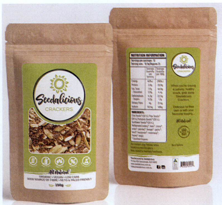
Figure 2. Unregistered SEEDALICIOUS Crackers

The FDA verified through online monitoring or post-marketing surveillance that the abovementioned food supplement and food product are not registered and no corresponding Certificates of Product Registration (CPR) have been issued. Pursuant to the Republic Act No. 9711, otherwise known as the “Food and Drug Administration Act of 2009”, the manufacture, importation, exportation, sale, offering for sale, distribution, transfer, non-consumer use, promotion, advertising or sponsorship of health products without the proper authorization is prohibited.