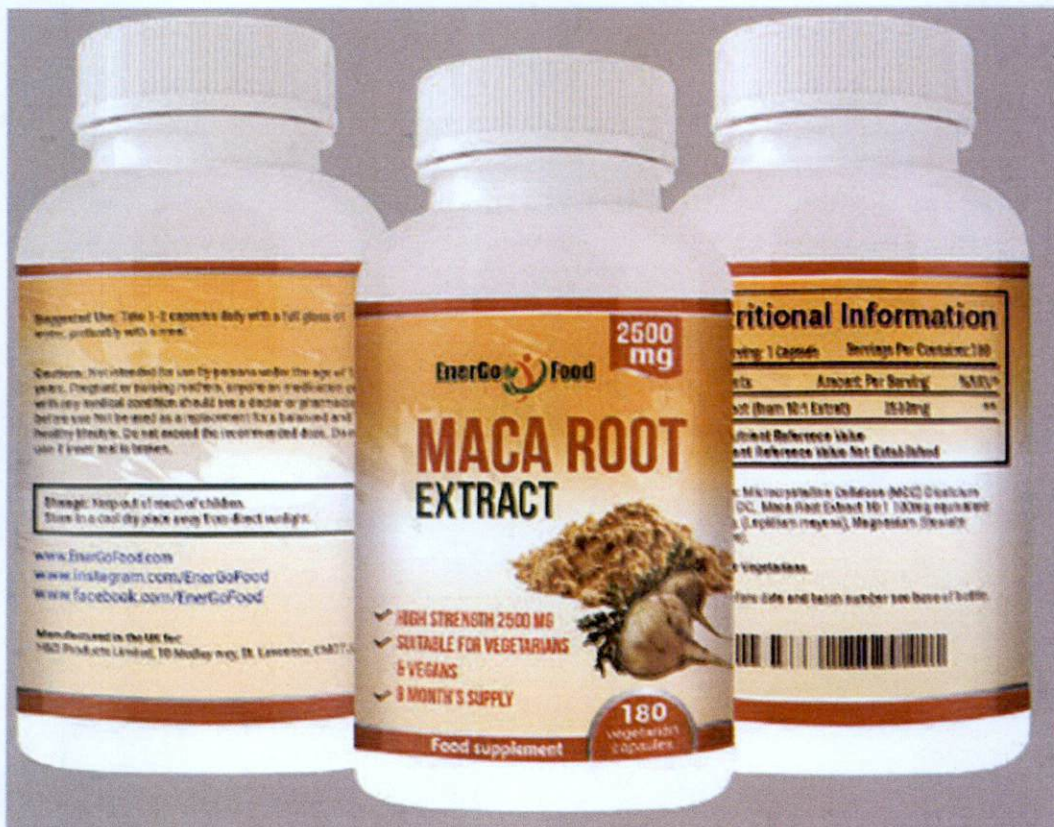
Figure 1. Unregistered ENERGO FOOD Maca Root Extract Food Supplement

The Food and Drug Administration (FDA) warns all healthcare professionals and the general public NOT TO PURCHASE AND CONSUME the following unregistered food supplement and food product: