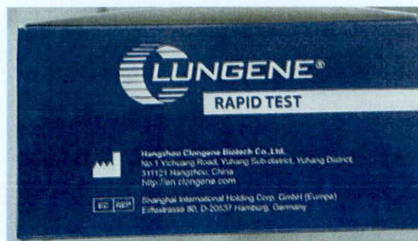
Figure 1. Uncertified Clungene Rapid Test COVID-19 Antigen Rapid Test Cassette