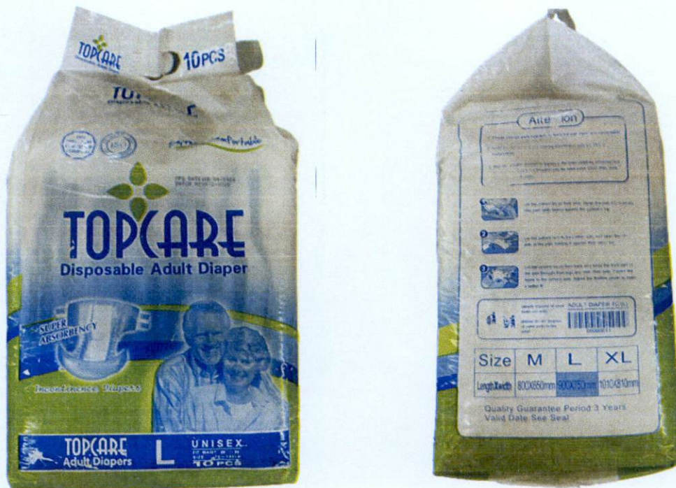
Figure 1. Unnotified TopCare Disposable Adult Diaper (L)

The Food and Drug Administration (FDA) warns all healthcare professionals and the general public NOT TO PURCHASE AND USE the unnotified medical device product: