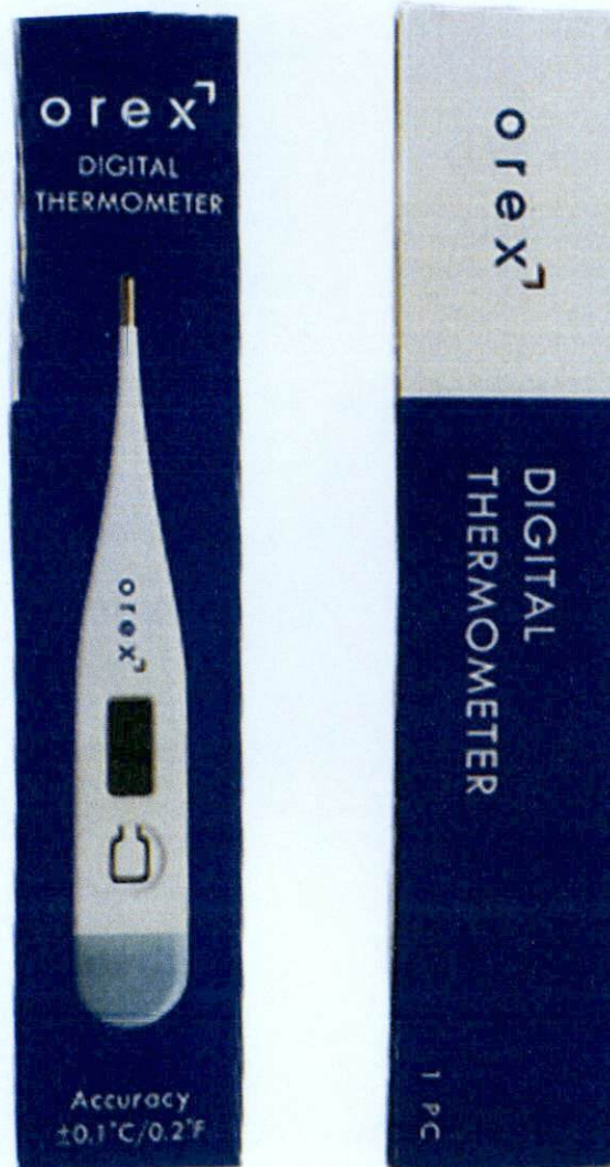
Figure 1. Unregistered Orex Digital Thermometer

The Food and Drug Administration (FDA) warns all healthcare professionals and the general public NOT TO PURCHASE AND USE the unregistered medical device product: