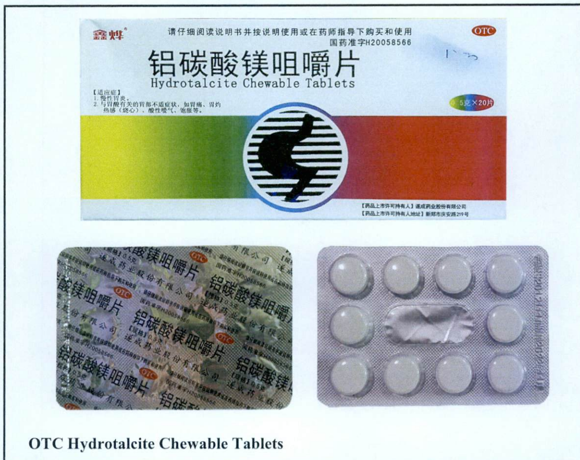
OTC Hydrotalcite Chewable Tablets

The Food and Drug Administration (FDA) advises the public against the purchase and use of the following unregistered drug products: