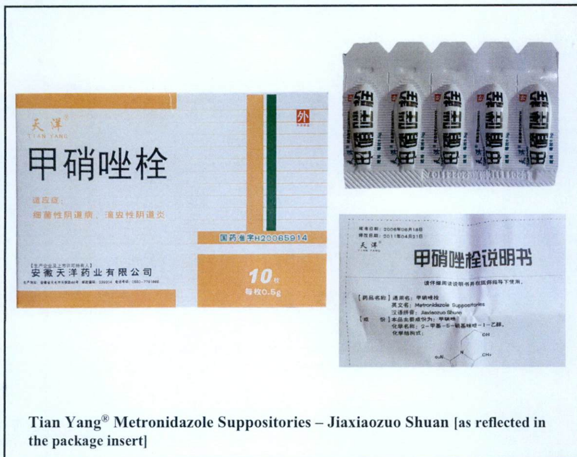
Figure 1. Unregistered drug product

The Food and Drug Administration (FDA) advises the public against the purchase and use of the following unregistered drug products: