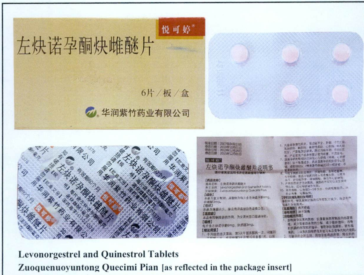
Levonorgestrel and Quinestrol Tablets Zuoquenuoyuntong Quecimi Pian [as reflected in the package insert]